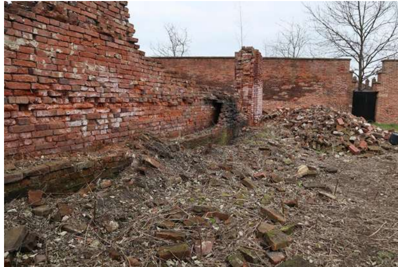
We've started to re-clear the east gate area