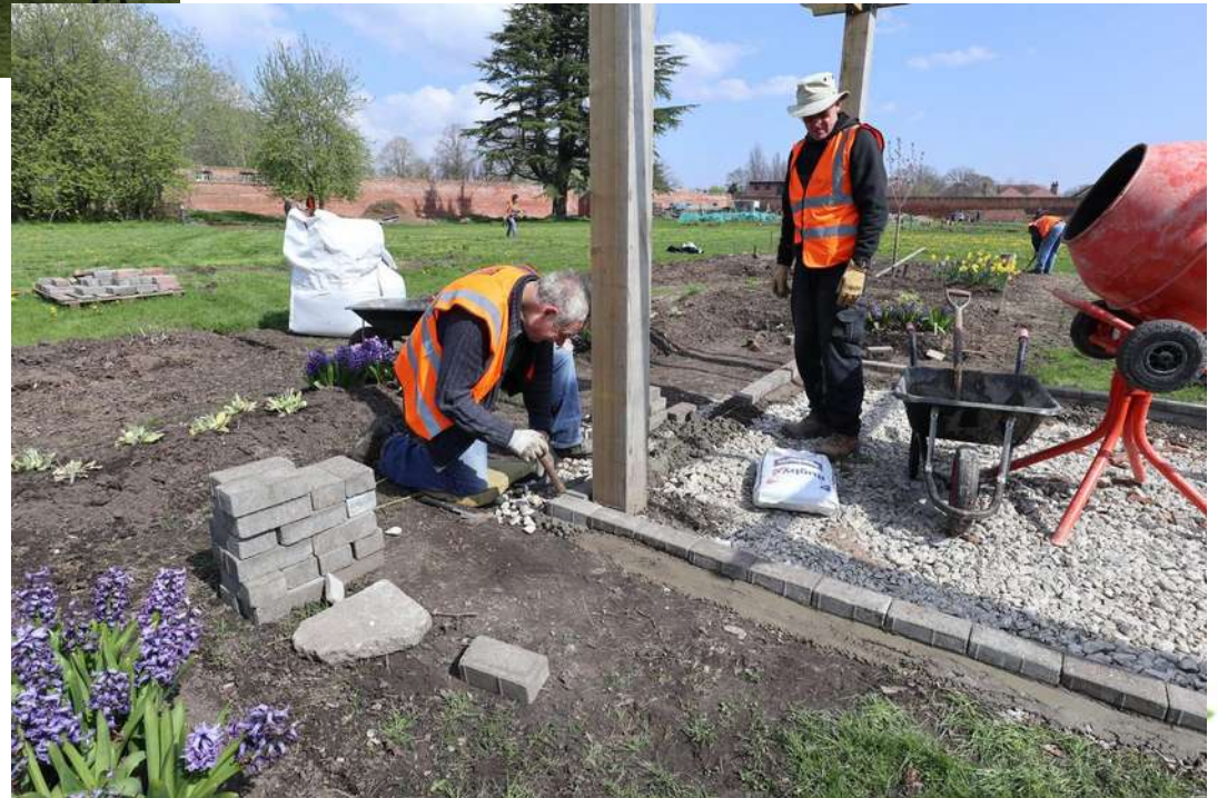
Laying out the pergola base