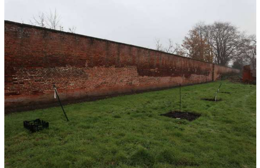
New orchard underway!