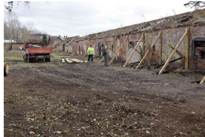
Back-sheds need shoring up