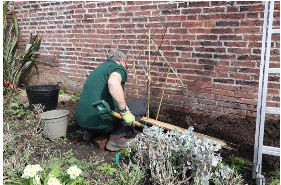
Planting the Plum tree, donated by Wollaton W.I.