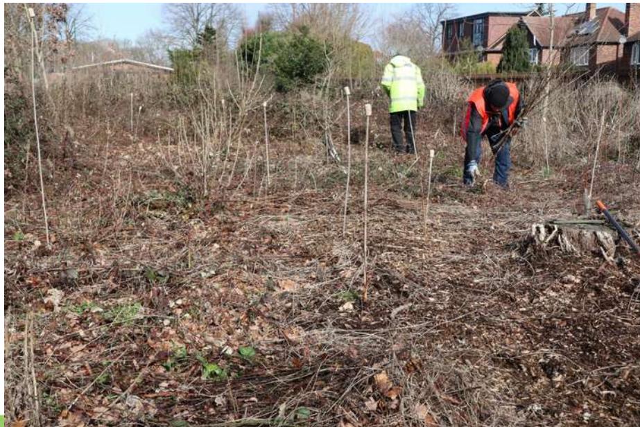
Clearing undergrowth from east slip tree nursery