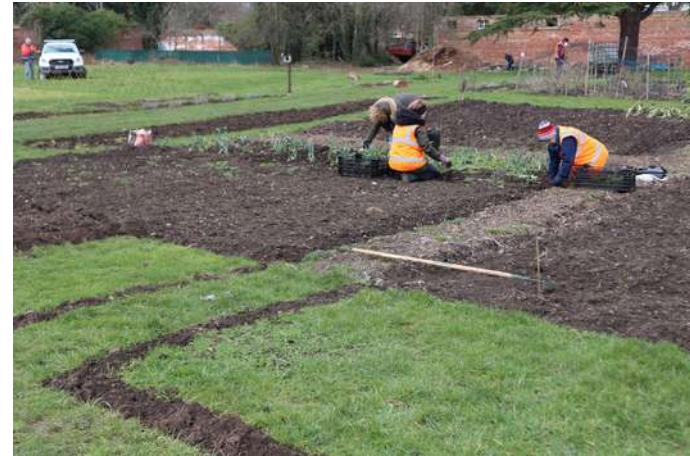
Preparing large veg beds