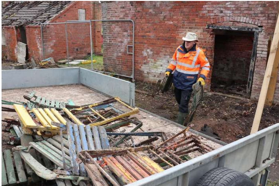
More clearing of the back sheds