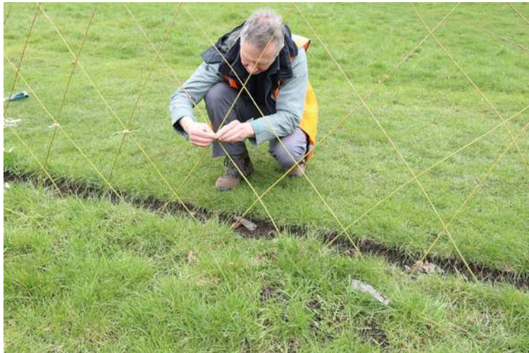
We're trying willow hedging