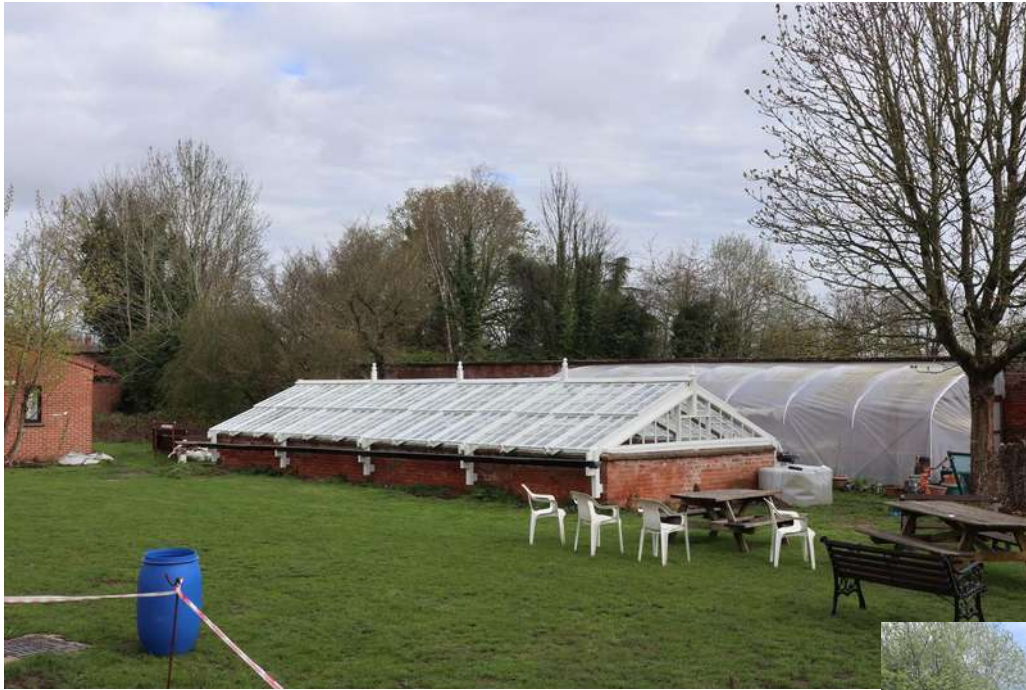
Cucumber house is now fully framed out