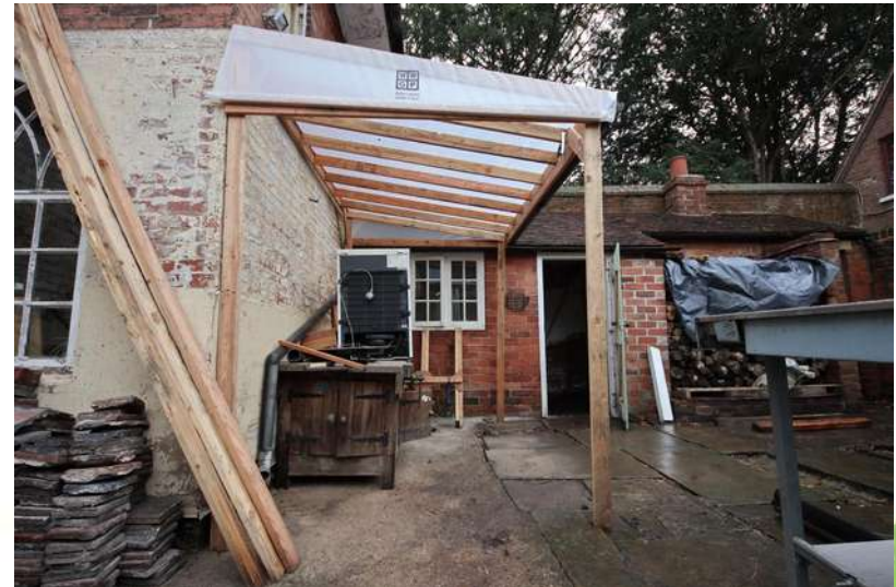
Cover for the outside workbench finished