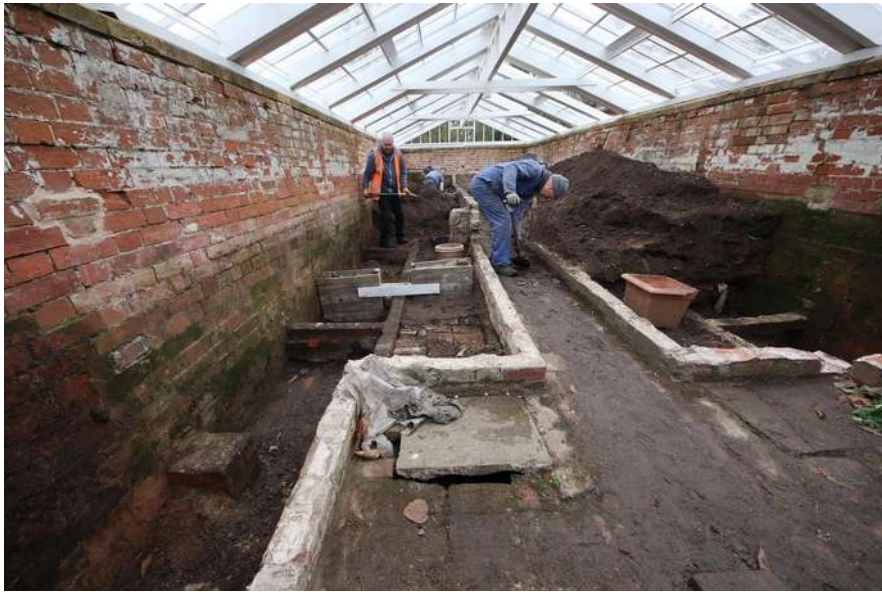
Clearing the cucumber house