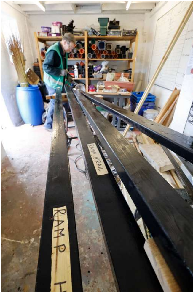
Rails for the new ramp