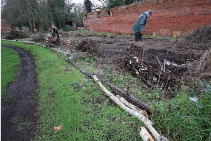
Clearing north wall area