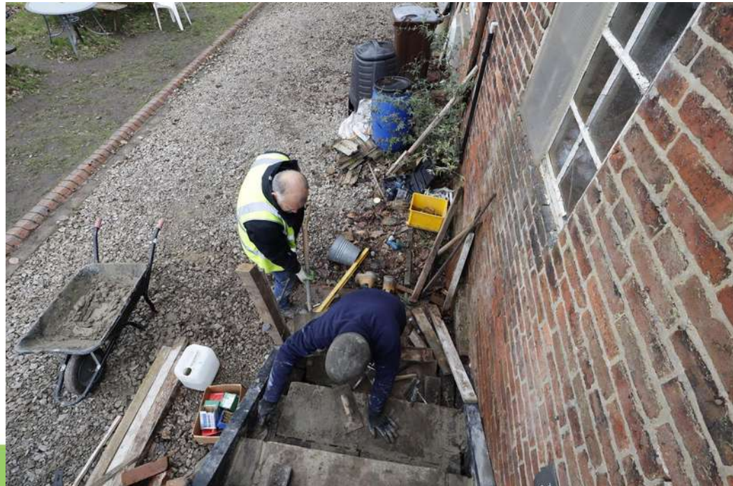
Steps for the new ramp!