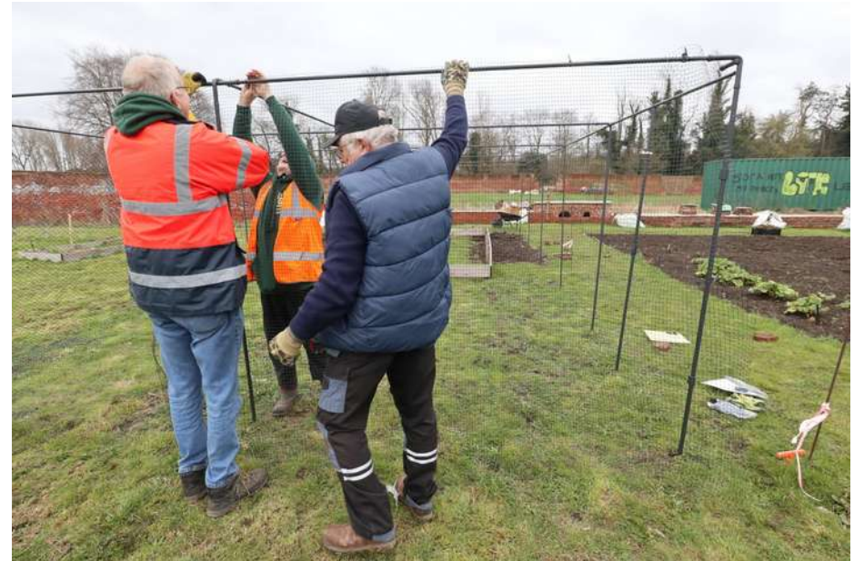
Constructing the new fruit cage