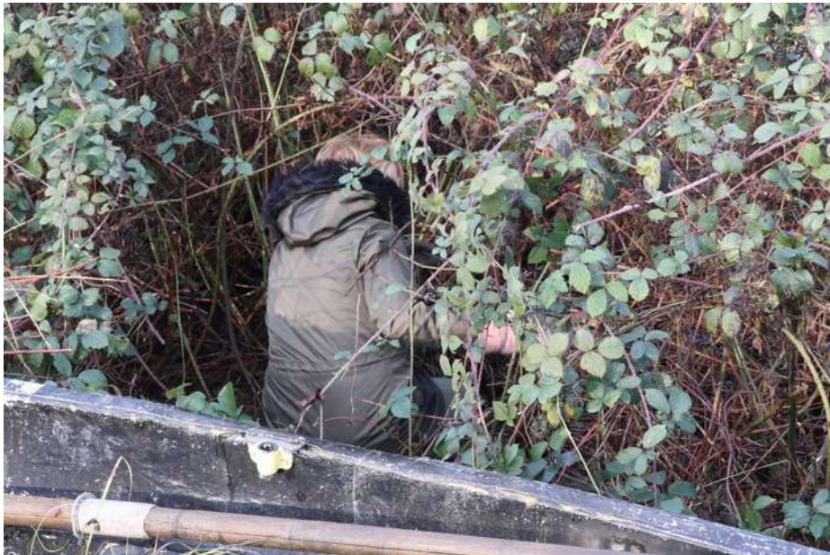
Clearing the brambles