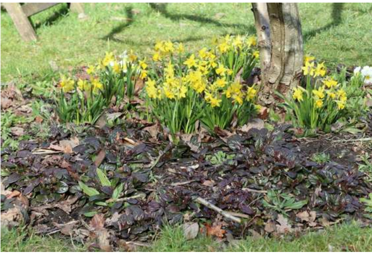
Spring has sprung!