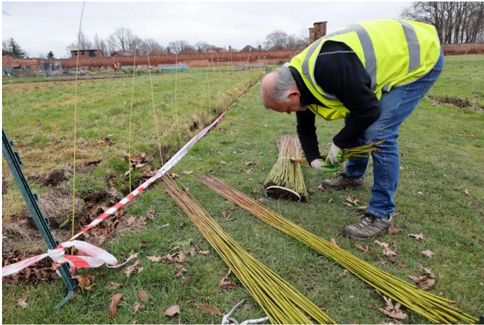
Starting work on the new sensory garden

We can, at last, get into the back-sheds and start clearing them.