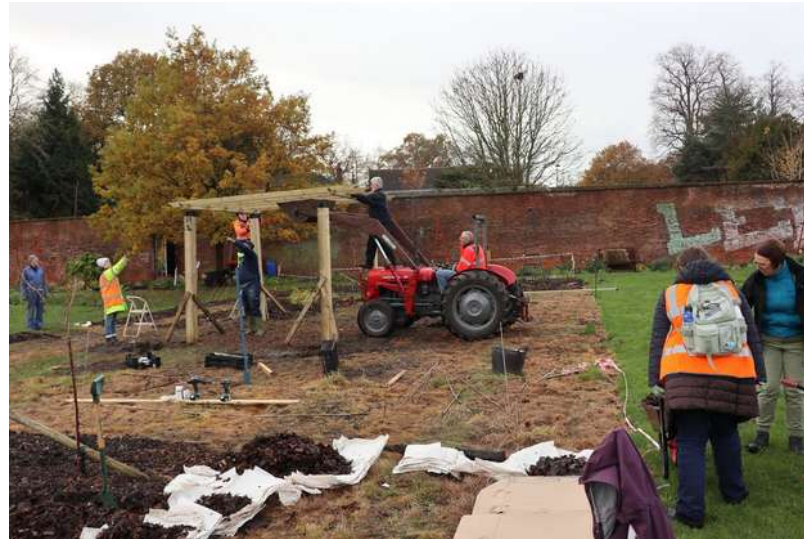
More work on the pergola