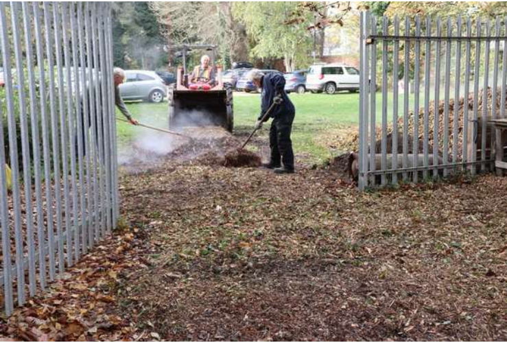
Laying down woodchip in the vehicle access road