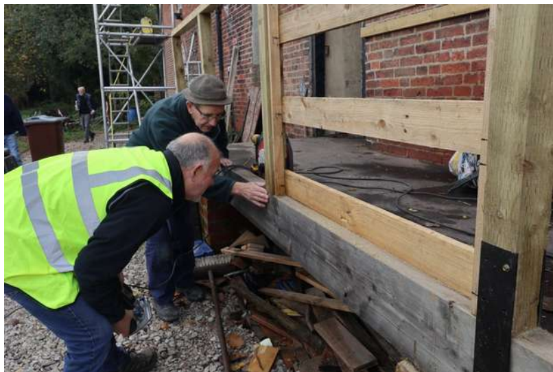
Is it straight?