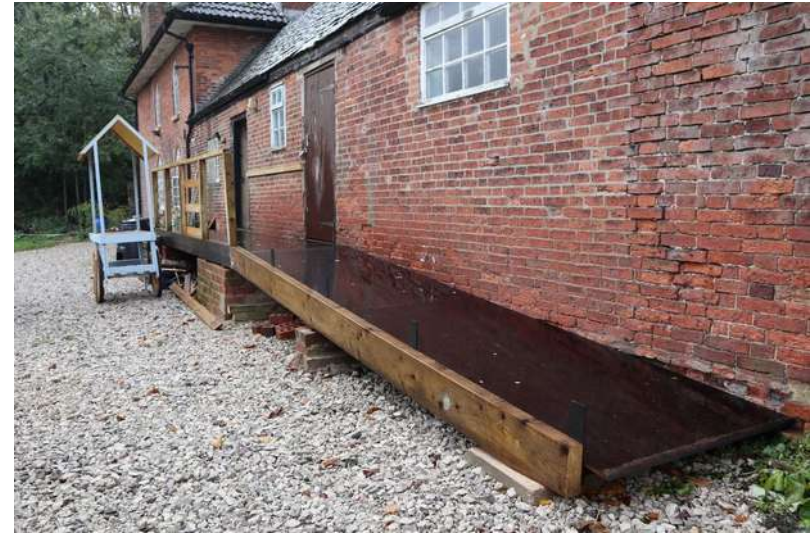
Access ramp almost done