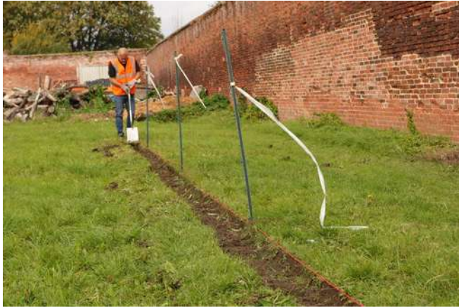
Marking out the new orchard