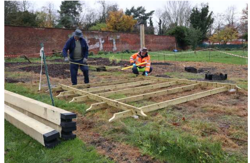
Starting work on the heritage garden pergola