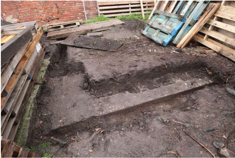
Foundation of one of the small lean-to greenhouses has been discovered