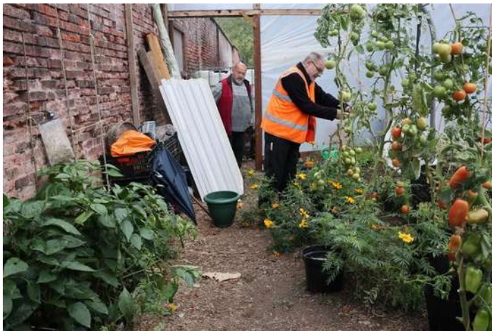
Still harvesting tomatoes!