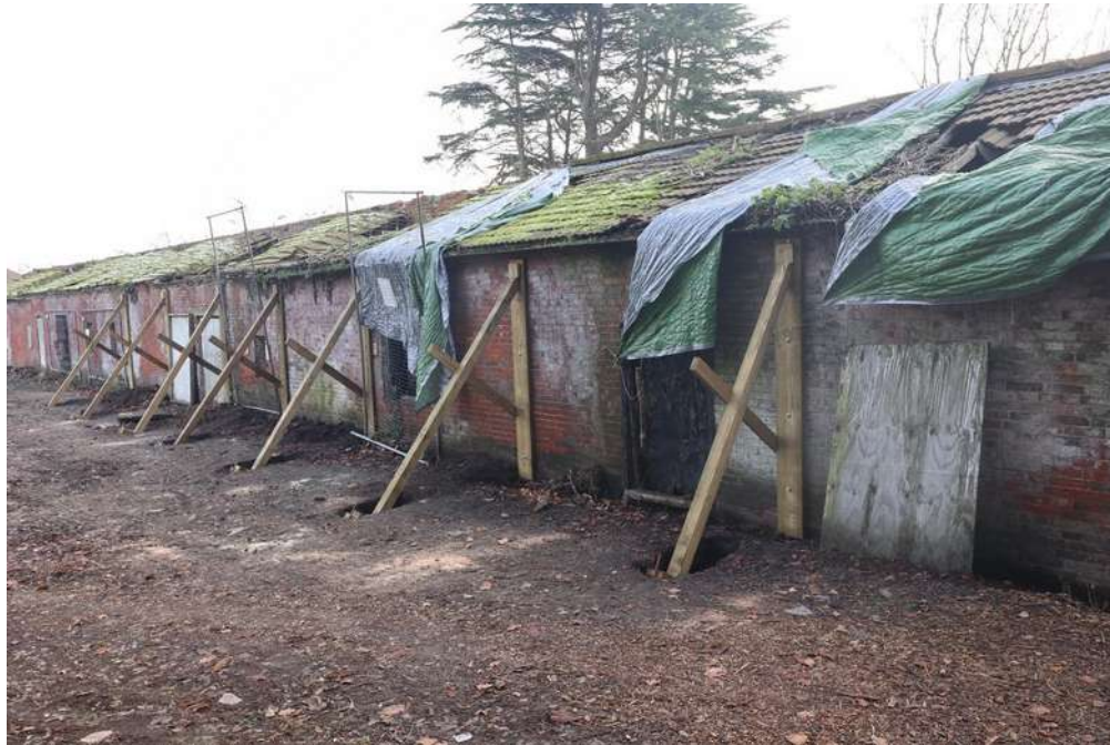
Bothy wall supported, awaiting removal of roof tiles