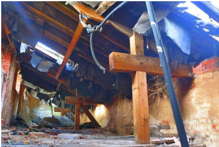
Interior of bothy in need of repair