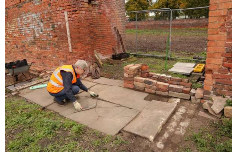
Discovering the original gate