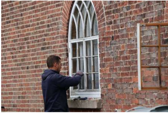
Repairing the cottage windows frames