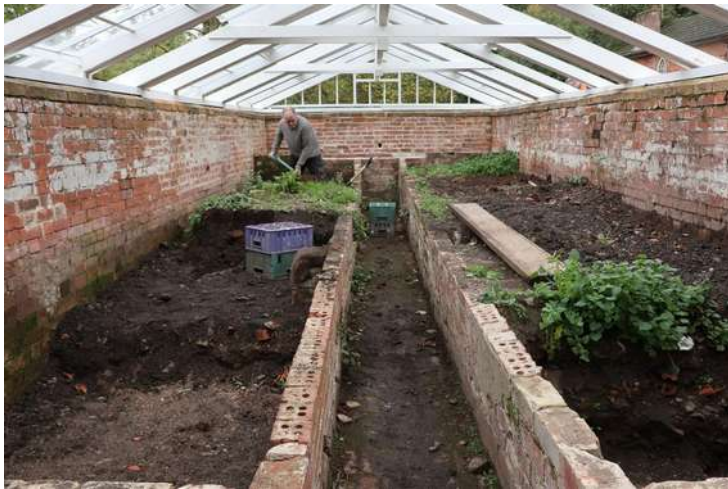
Clearing the interior of the cucumber house