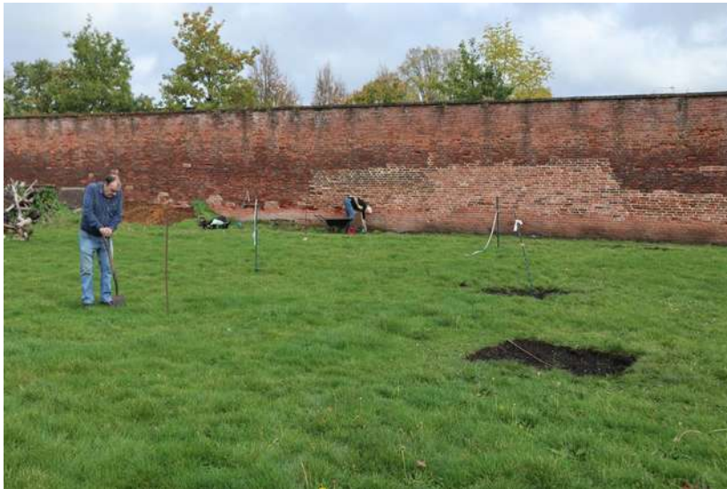
Preparing ground for the new fruit trees