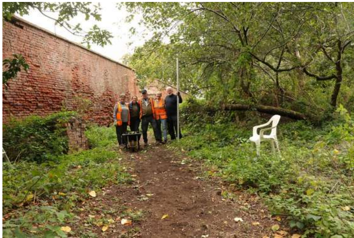
Renovating the old apple tree