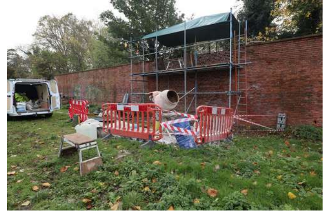
Bonsers almost finished south wall repair