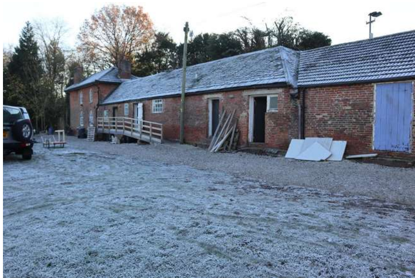
Cold and frosty morning!