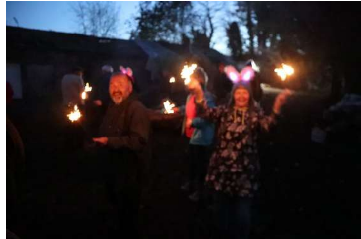
Bonfire night – out come the bunny-ears