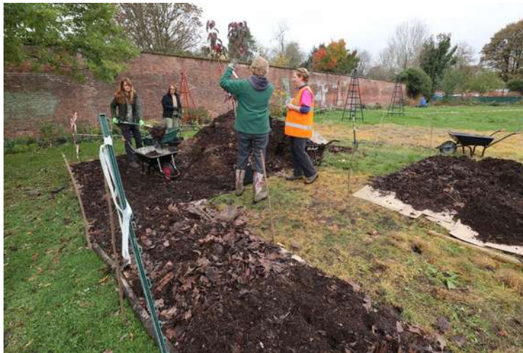
Starting work on the Heritage garden