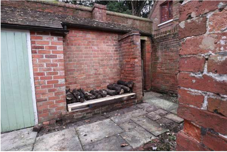
Back yard of cottage finally clear!