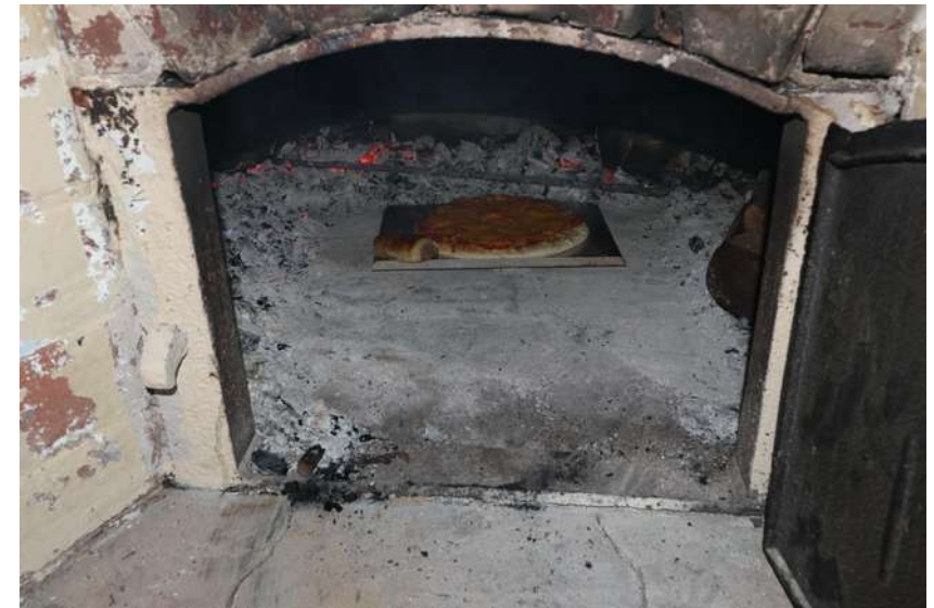
Pizza in the, now working, bread oven