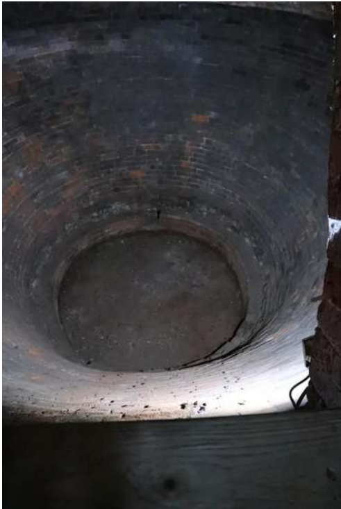
Ice-house cleared and lighting installed