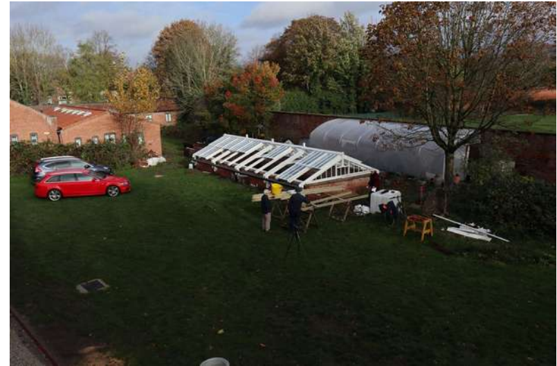
Cucumber house progressing