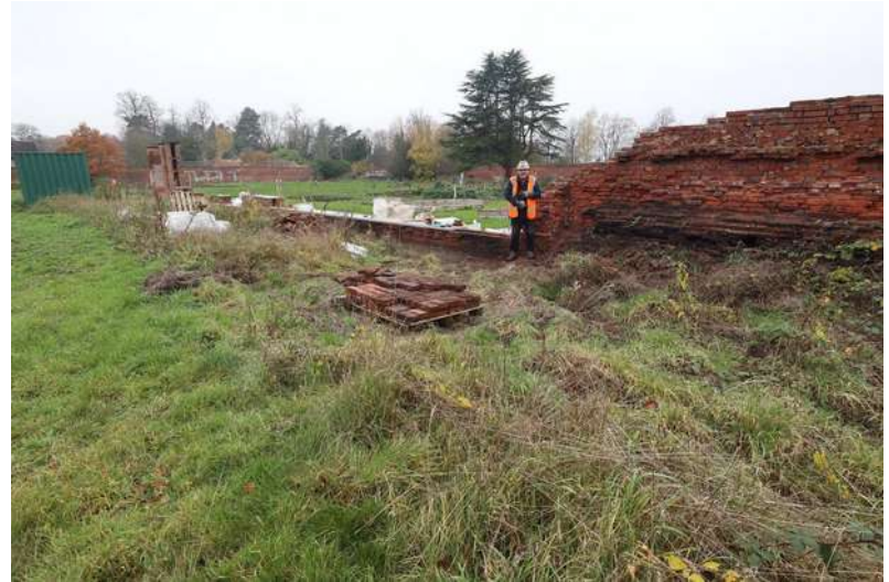
Central wall protected and made safe