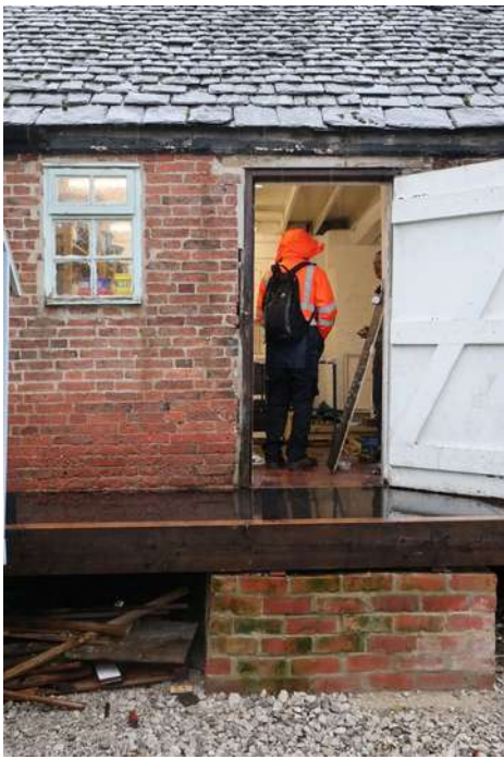
First decent rain in a long time