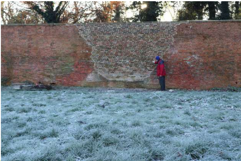
South wall repair is finished