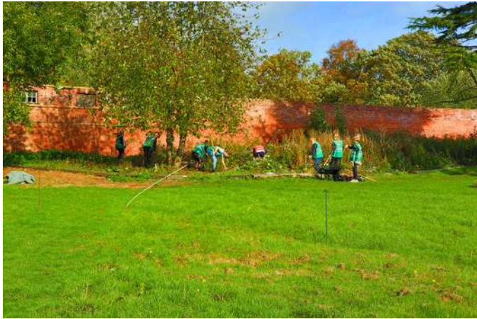
Corporate group clearing under the north wall