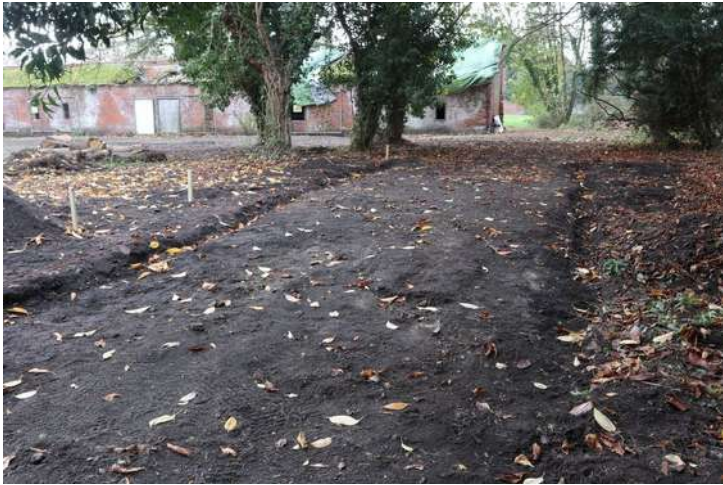
Team from Portland college have cleared the old garden entrance