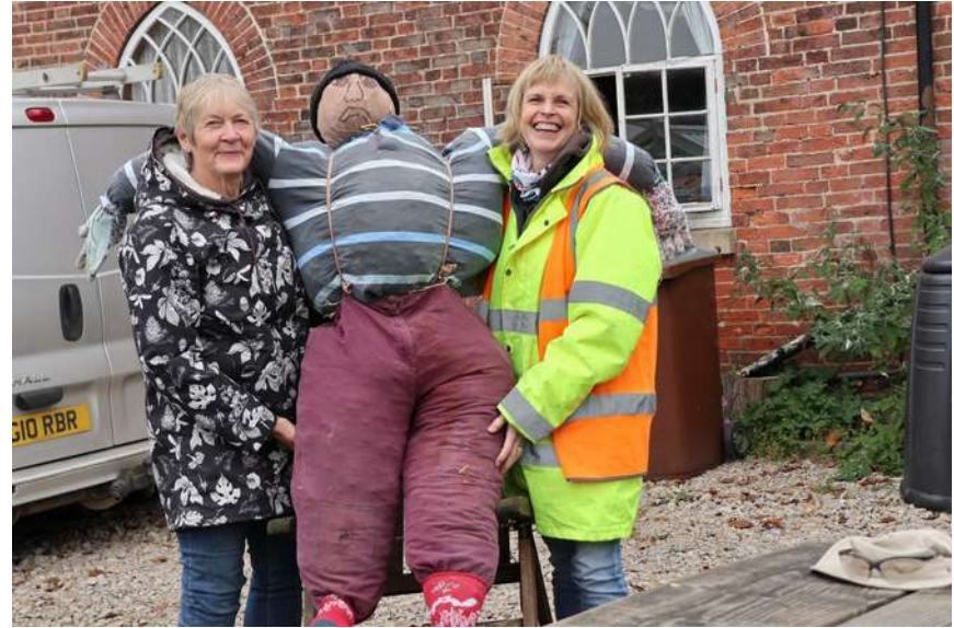
A volunteer in need of help?