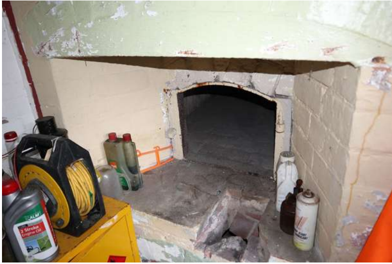
Bread oven cleaned up