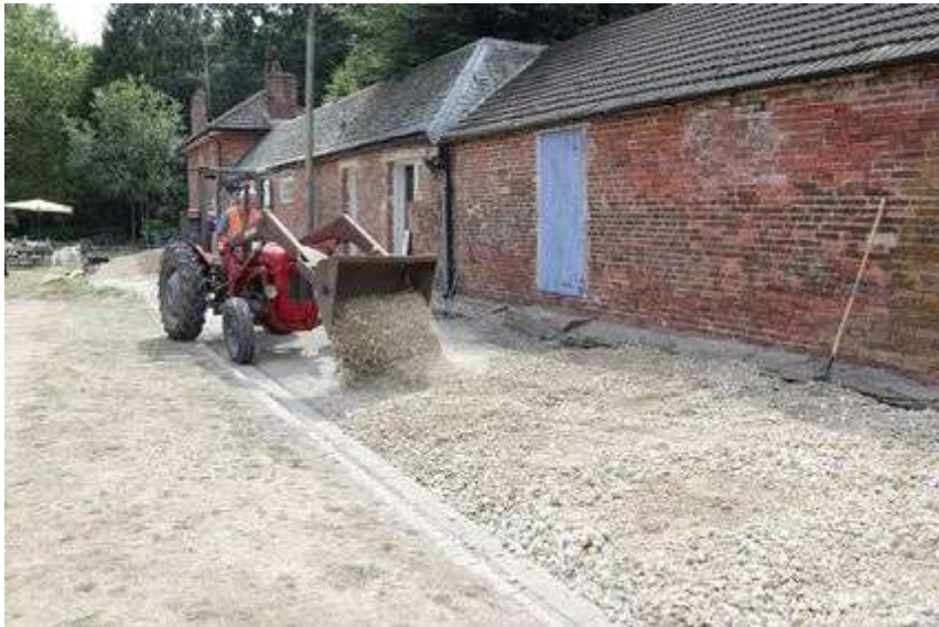
More work on roadway