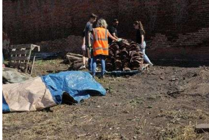
Corporate group collecting old terracotta roof tiles