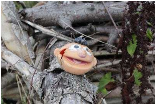
The things we find!