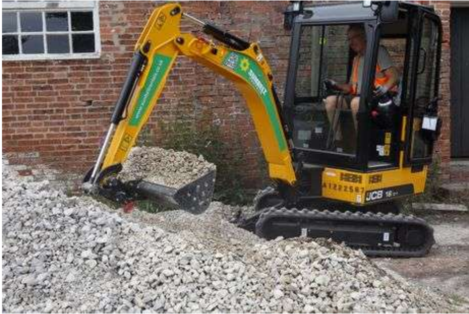
Starting work re-surfacing the roadway