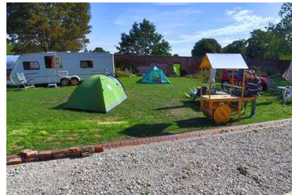
Overnight camps for an early start!