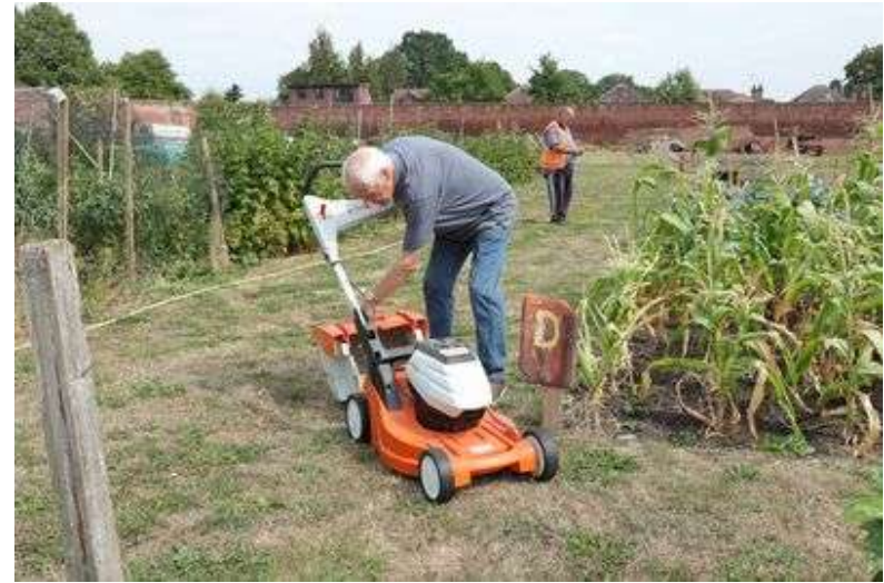
New electric mower's first outing