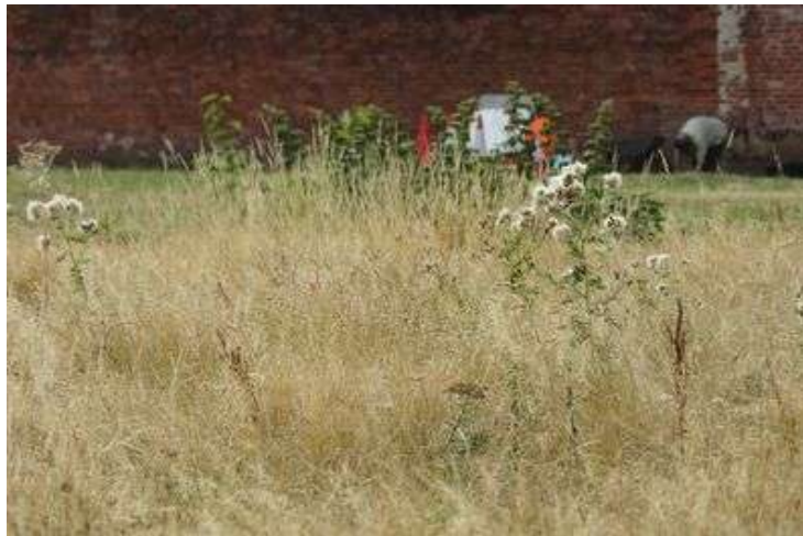
Remember the drought!