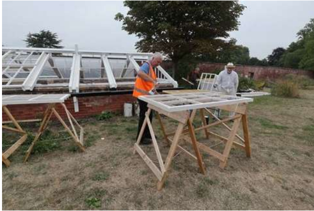
Painting frames – 2 undercoats and 3 top coats each!