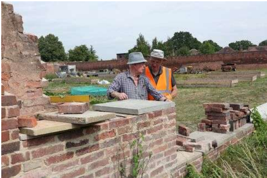
Conserving/repairing the central heated wall