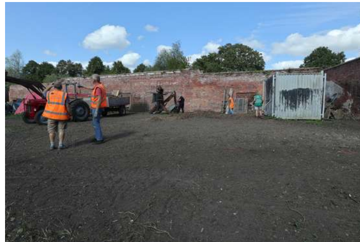
North-east corner cleared