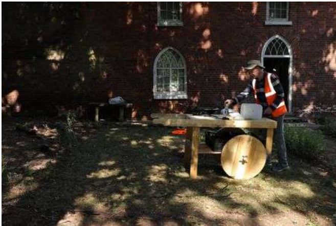
Working on the new veg. stall