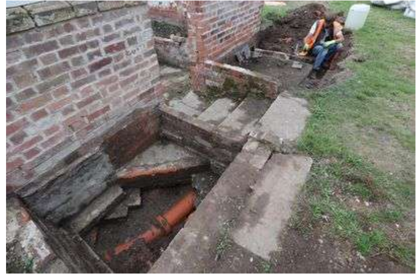
Drainage pipe discovered under sunken greenhouse