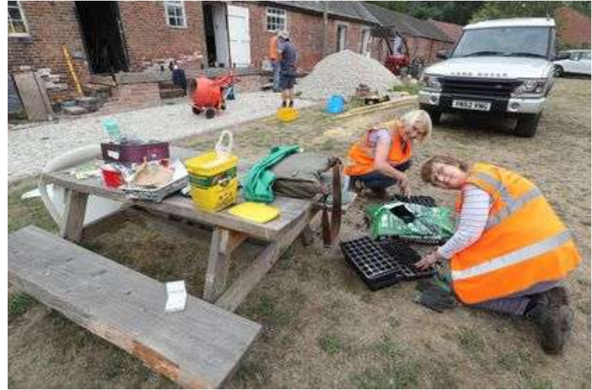
Sowing Autumn/Winter crops