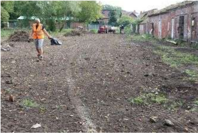
Collecting rubble buried in northern slip-garden