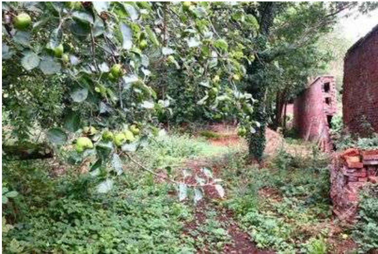
Old apple tree starting to produce again