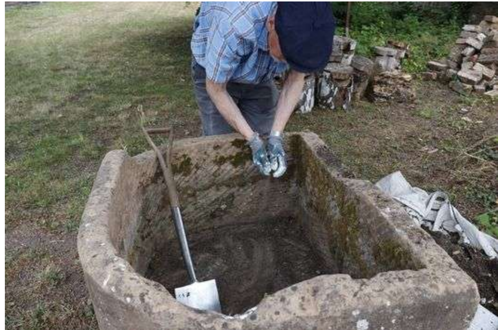
Cleaning out original stone trough for use with the sunken greenhouse