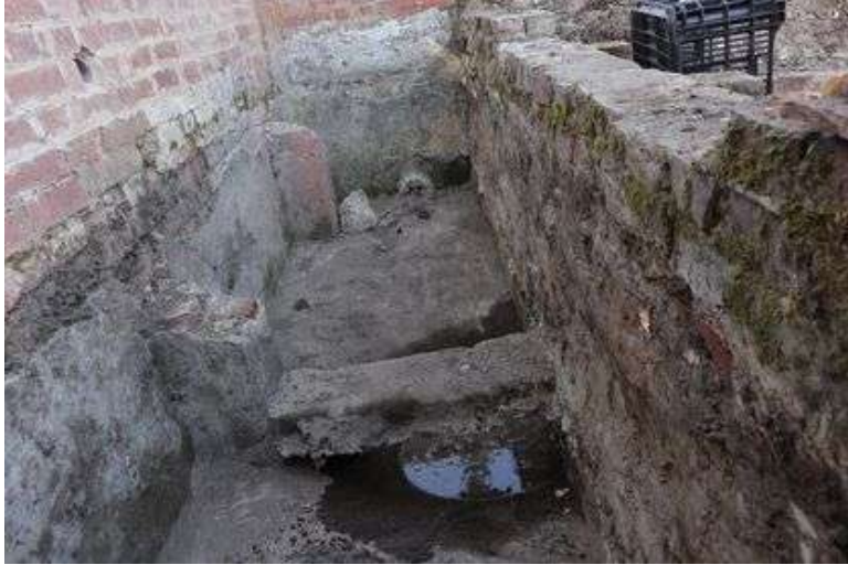
Mysterious structures in the sunken greenhouse