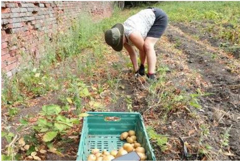
Collecting spuds from the north slip-field