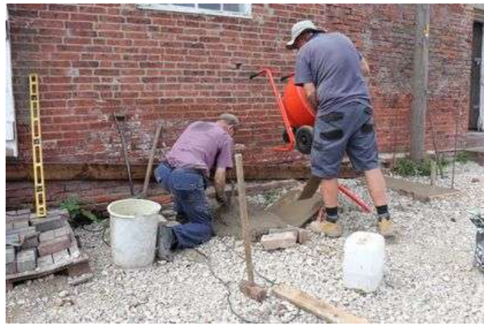
More work on the access ramp