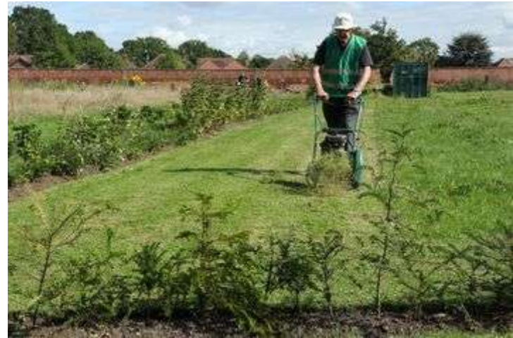
Mowing the green (at last!) grass