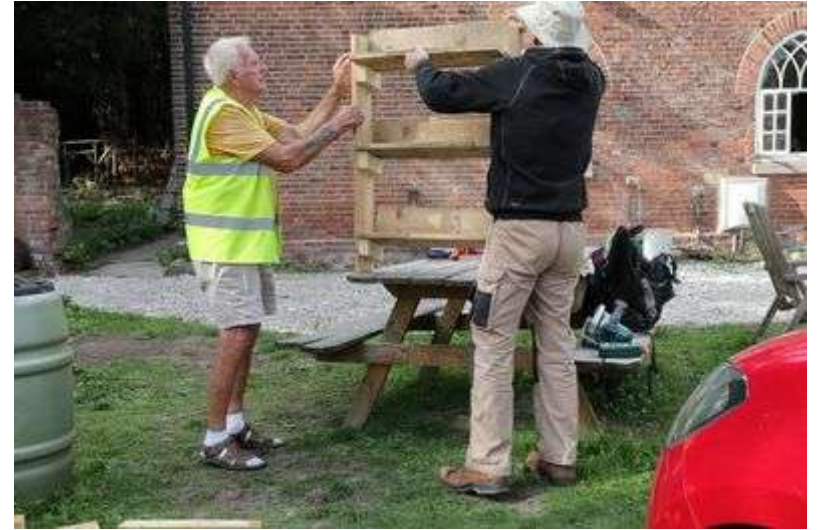
Making a bookshelf for the gardener's house