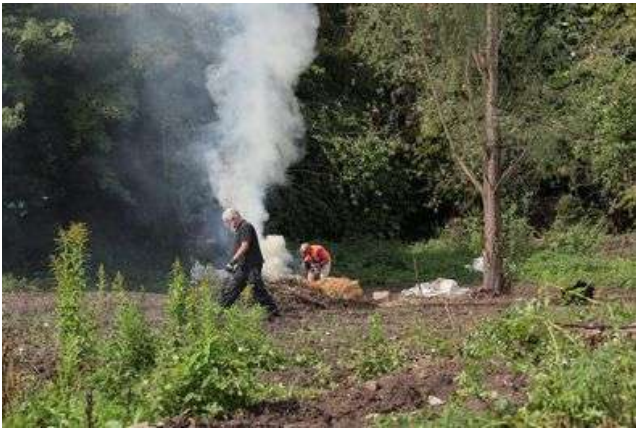
Clearing near old north entrance