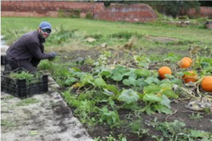
Squash bed ready for harvest