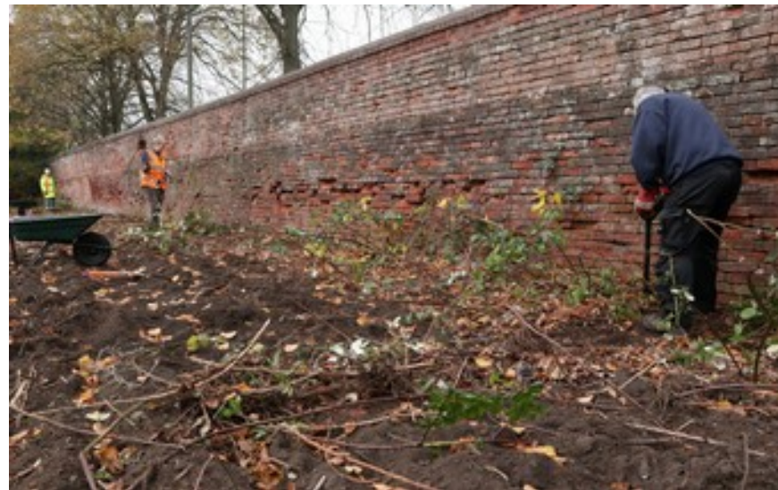
Clearing north slip gardens