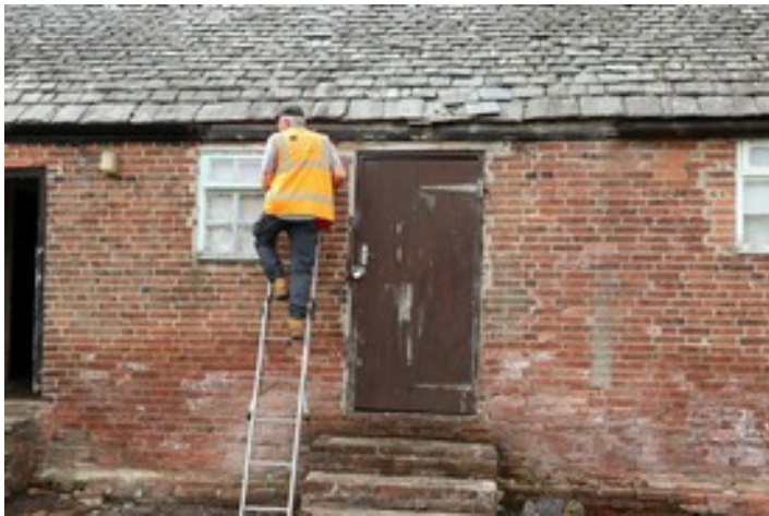
Checking guttering and roof on old sheds