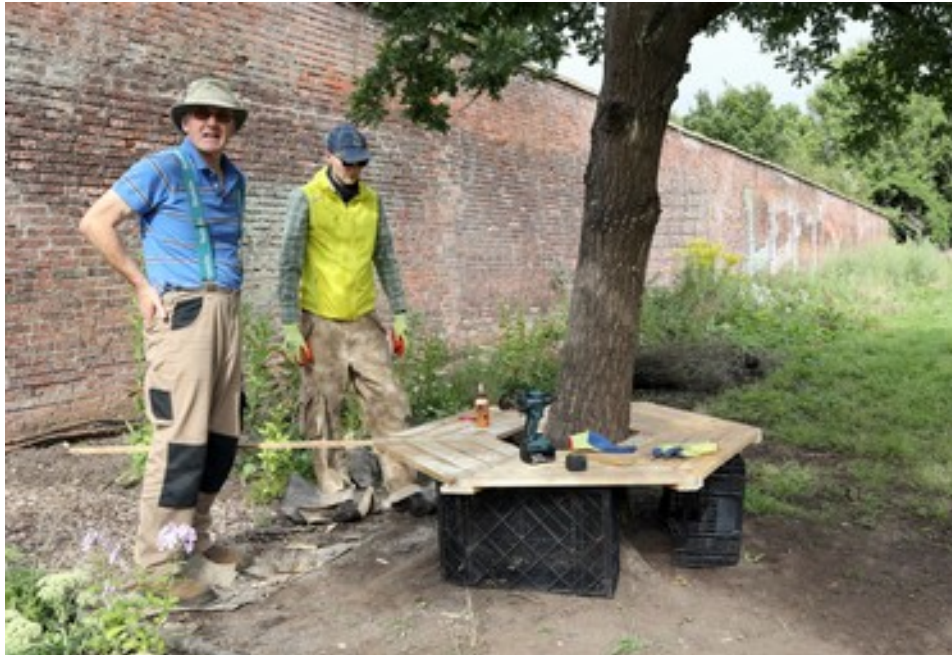
Constructing the new seat for the small tree