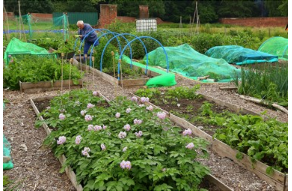
Bruce working in the veg plots