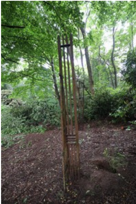
Mystery ironwork in slip woods