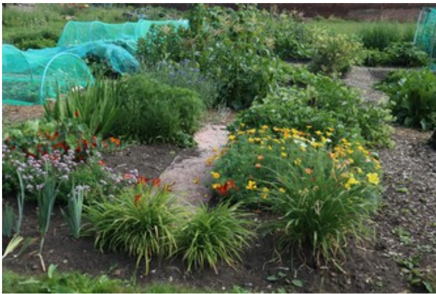
Cut-flower beds starting to bloom