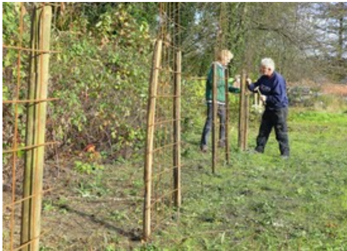
Finishing ivy frames