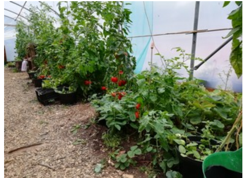
Polytunnel in full flow