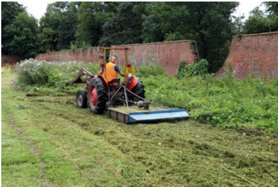
Mowing and clearing south wall border