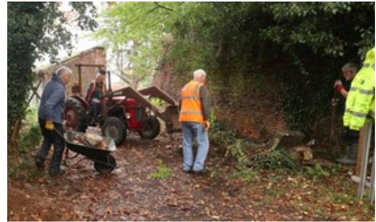
Clearing around north entrance