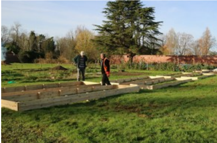
More growing beds for next year.