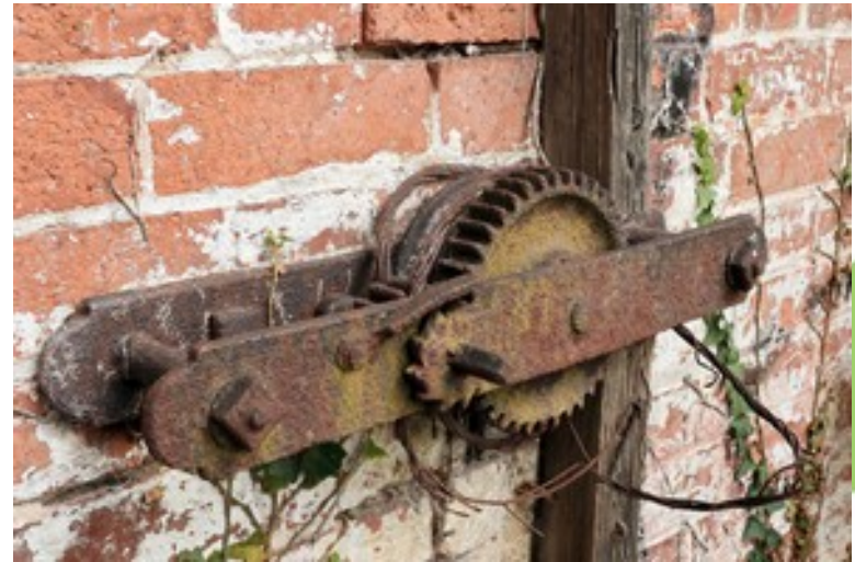
Winding gear used in old greenhouses