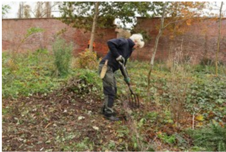
Preparing ground for new native tree saplings