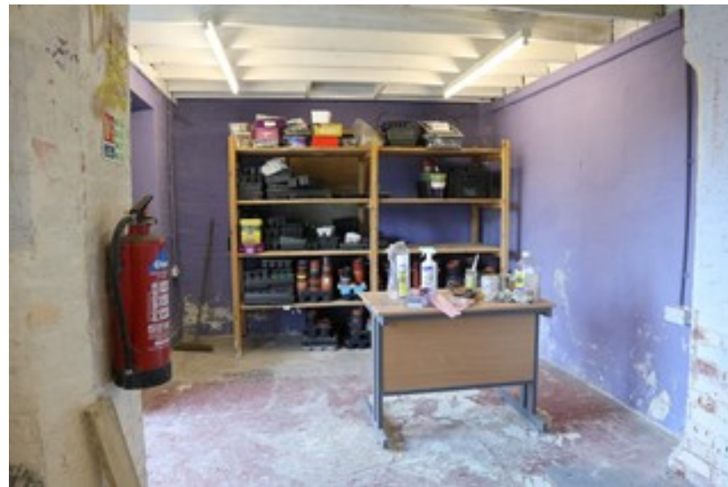
Cleared another storage shed