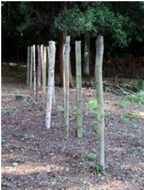
Dead-hedge extension underway