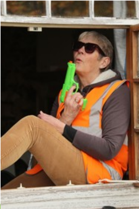
Jane Bond: 007 (oh, oh dear)