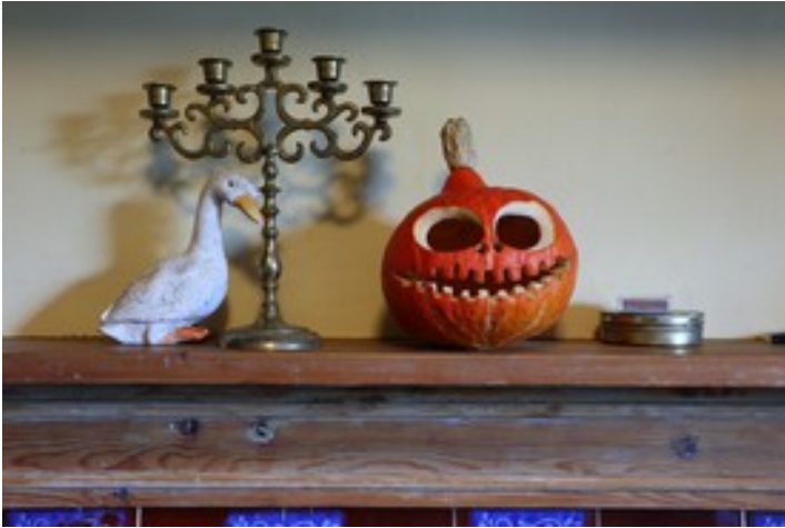
Classy kitchen furniture!