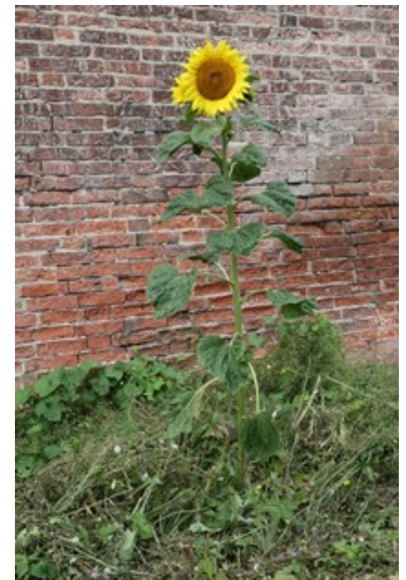
Who planted this giant ?