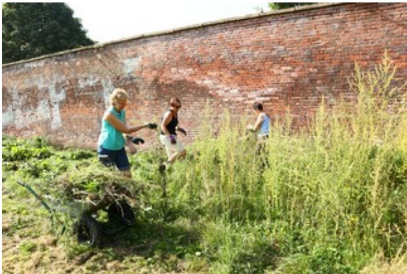
Clearing west wall borders