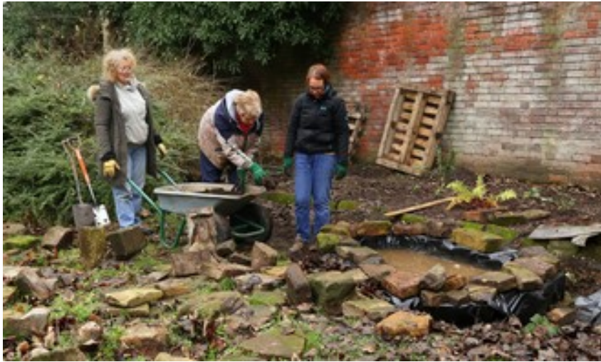
Starting work on pond area