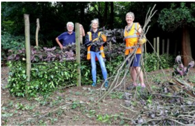
The Dead-hedge gang