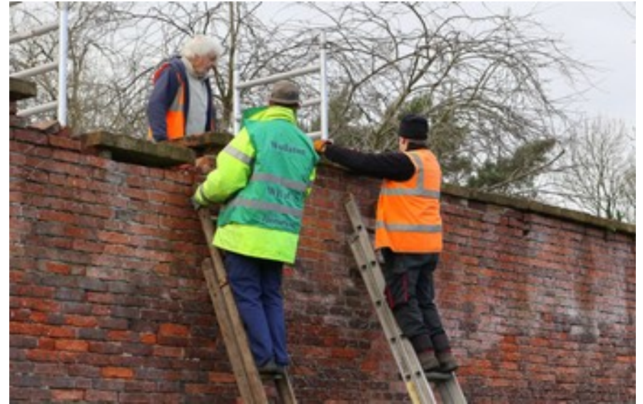
Replacing capstones on damaged East wall