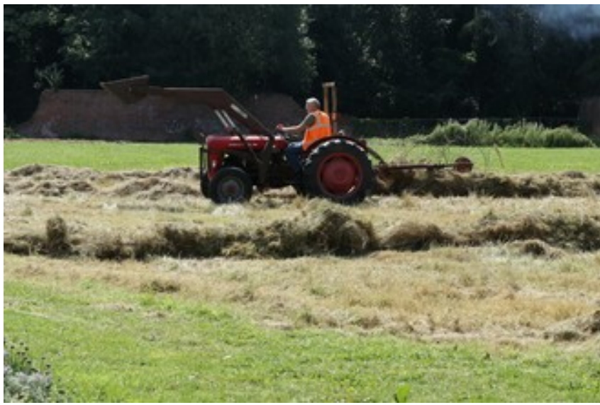
Turning the newly-cut hay