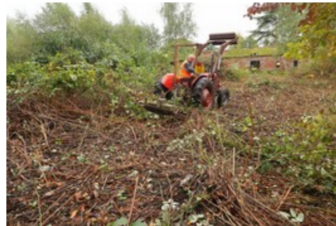
Clearing more of the north slips