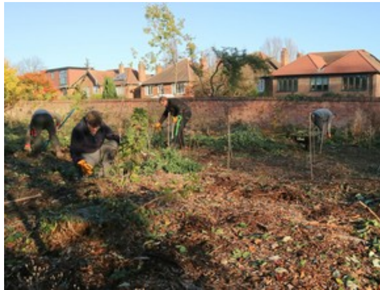
Planting native trees in East slip garden