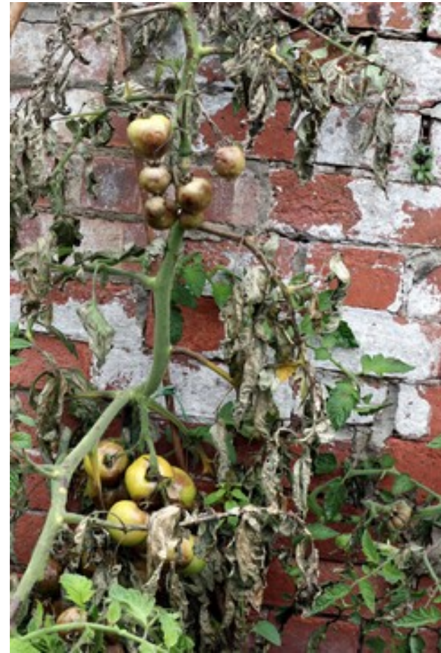
Sometimes it goes wrong! Blighted outside-tomatoes in the cucumber frame