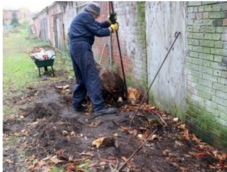
Still at it!