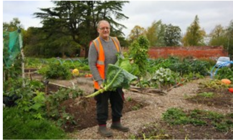
What a cabbage! (the green thing, not the old bloke)