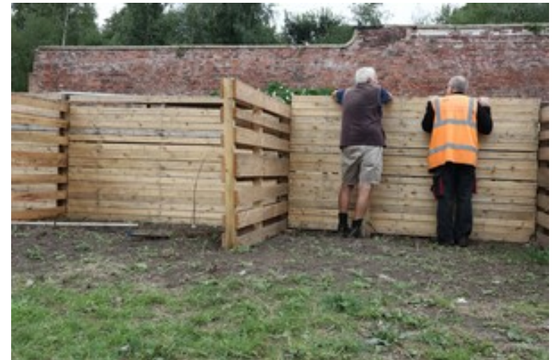
Err... are these the right way 'round?