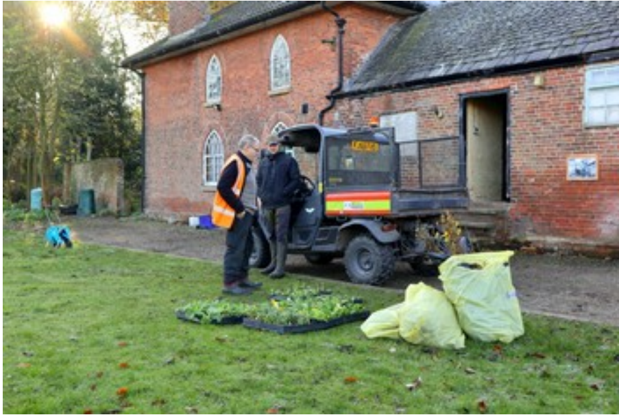
New plants and native trees for planting