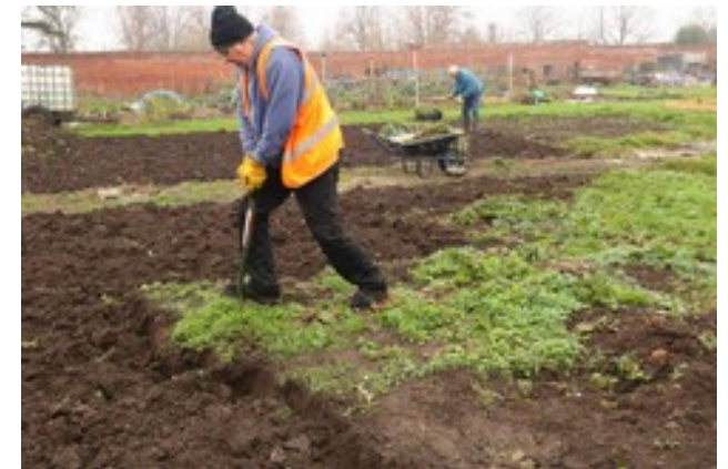
Preparing ground for next year