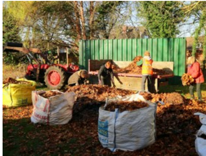
Autumn job – collecting leaves for leafmould