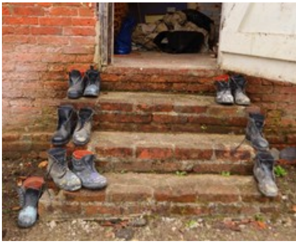
20 year-old boots found in shed