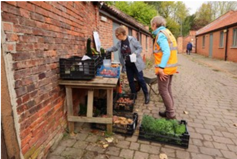
More produce for sale