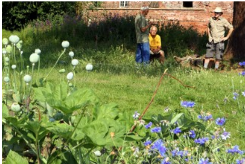
Welcome break under the old cedar tree