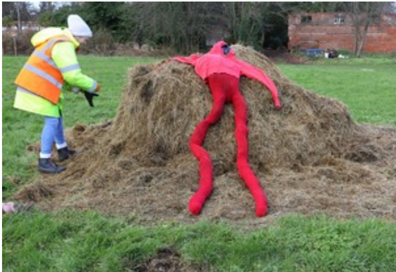
It will look like Santa – honest!