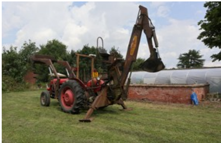
Ooh, a new digger for the tractor!