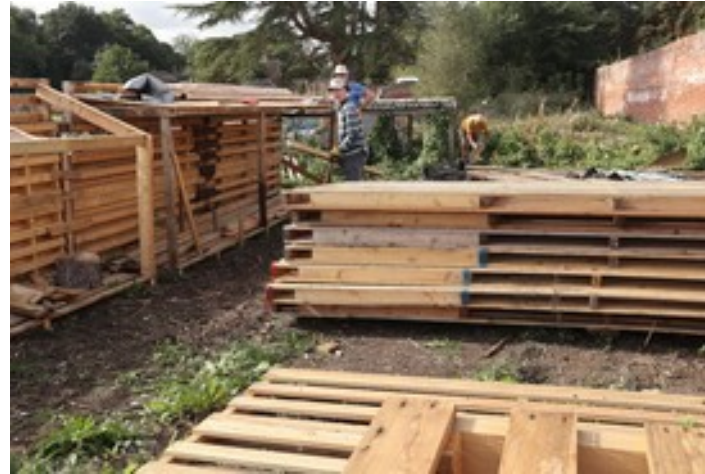
The 'Wood yard'