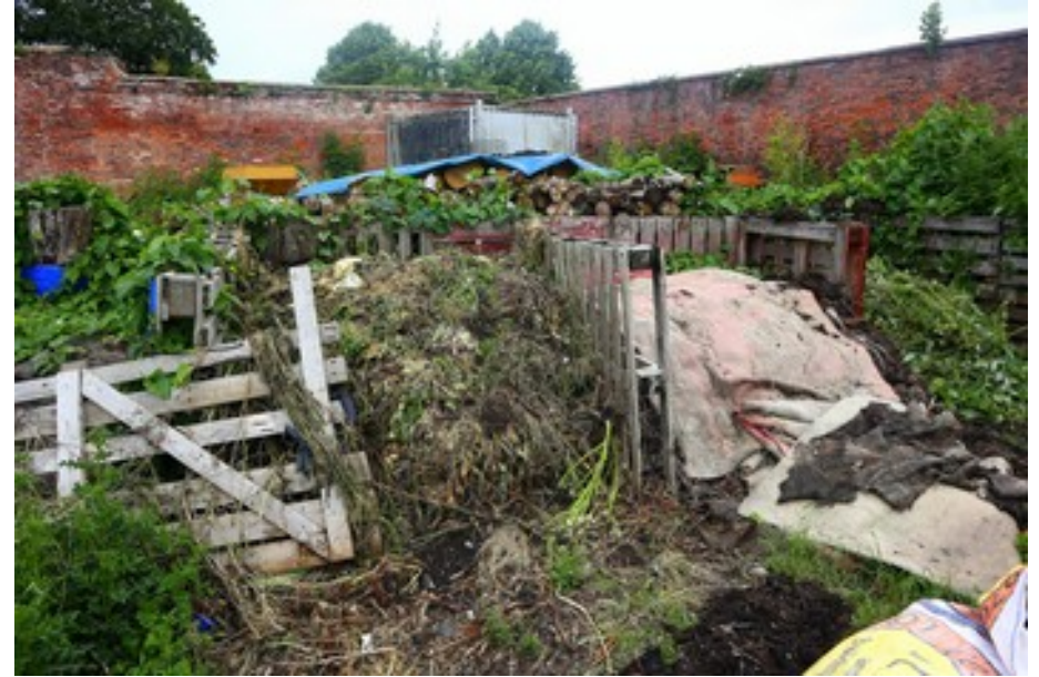
Old compost bins, they look tatty but it all got used!