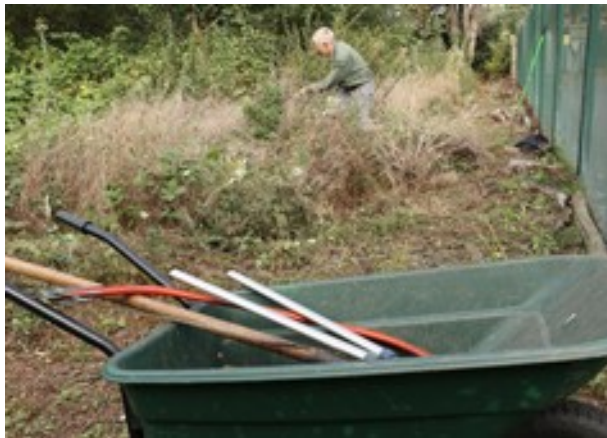
Starting to clear north slips for native hedging