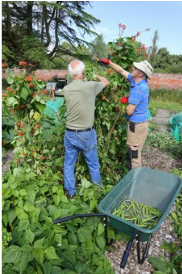
Harvesting runner beans