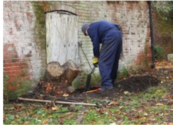
It's a long job removing these tree stumps