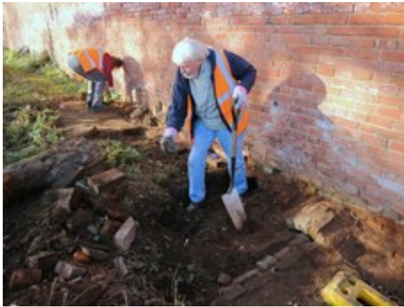
Mysterious pipework going under the North wall