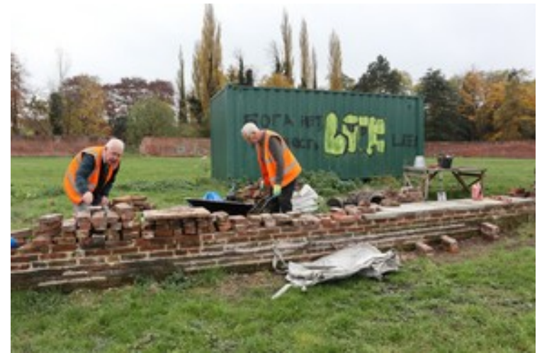
Repairing and protecting central wall