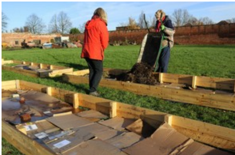
Preparing no-dig plots for next year