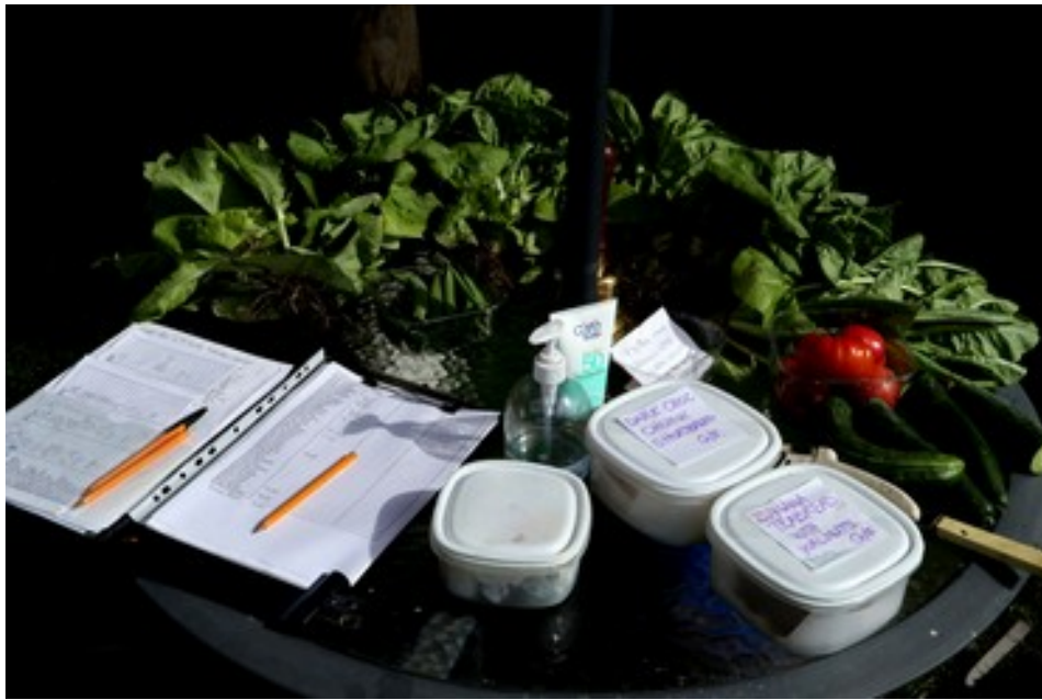
The table at tea-break