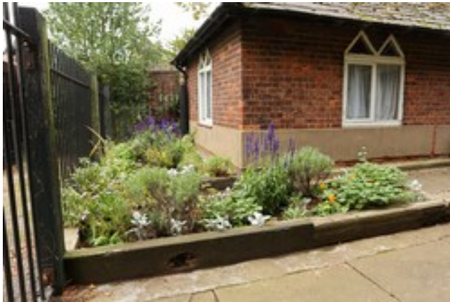
Lodge 1: planting and clearing