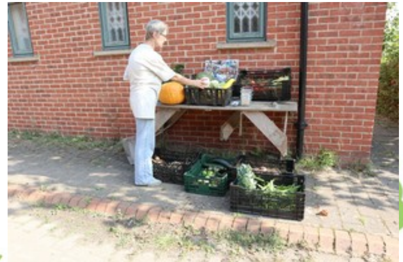
Produce for sale