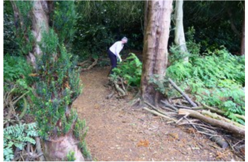
Elizabeth tidying the tour path through the slip woods