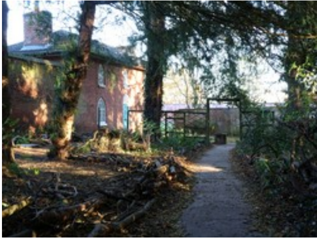
Original path to gardener's cottage uncovered