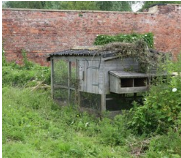
Where are the chippings?