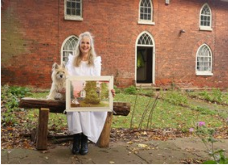
Two pictures, 100 years apart.