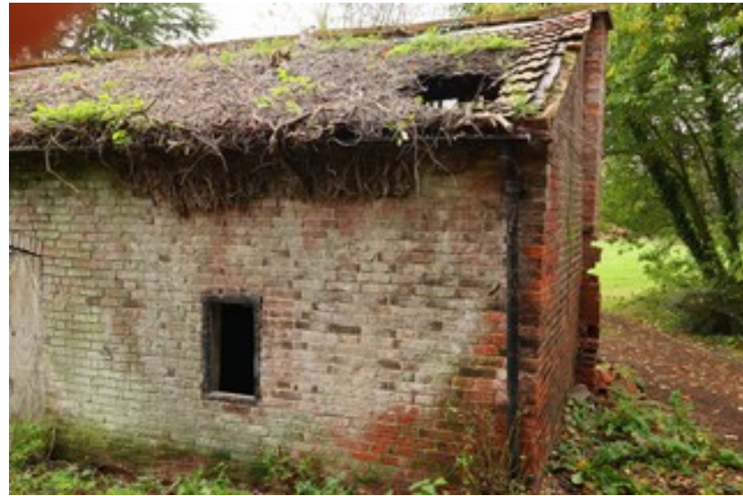
North wall bothies need looking after!