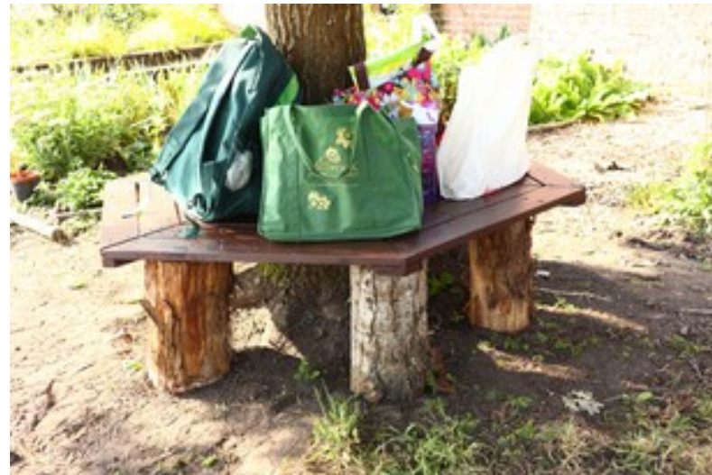
No room on the new seat!