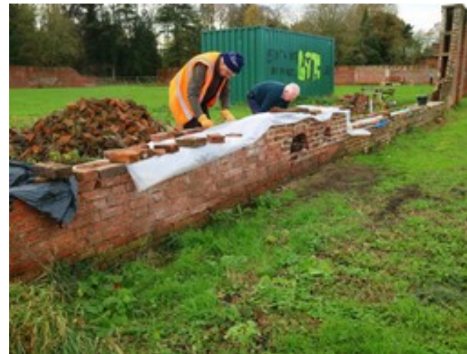
Centre wall fire-hole restored