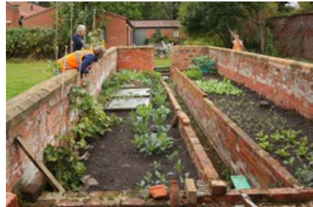
Cucumber frame with late winter crops