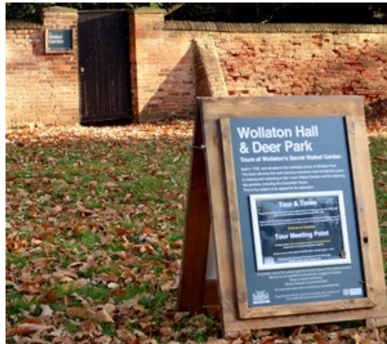
More tours after relaxing of Covid rules