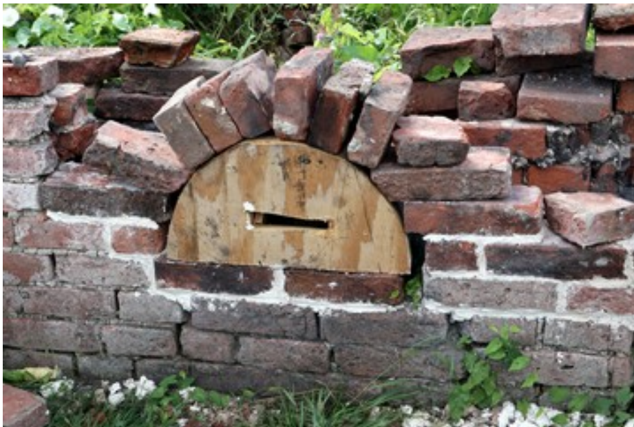
Stoke-hole for central wall heating system, under repair