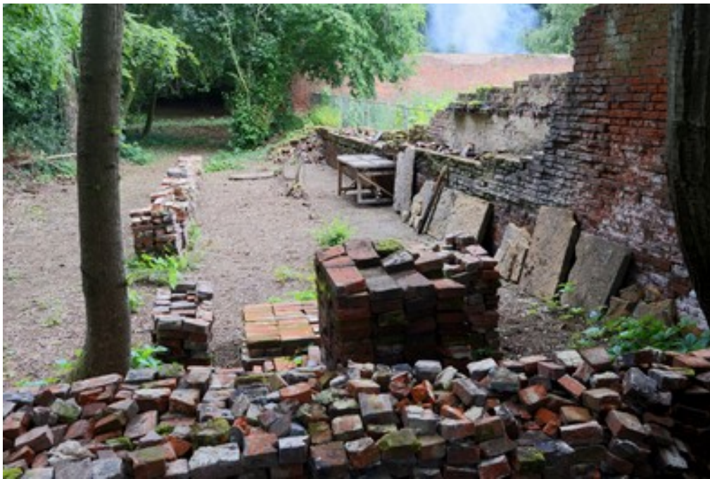
Ralph and Russ' clearance around damaged south wall