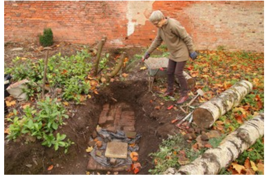
More of old conservatory uncovered