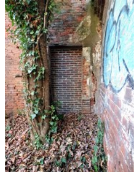
Original door into the (now demolished) boiler house