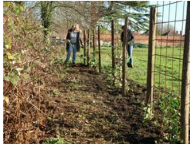
Ivy frames planted up (Ivy provides vital late- season food supply for bees)