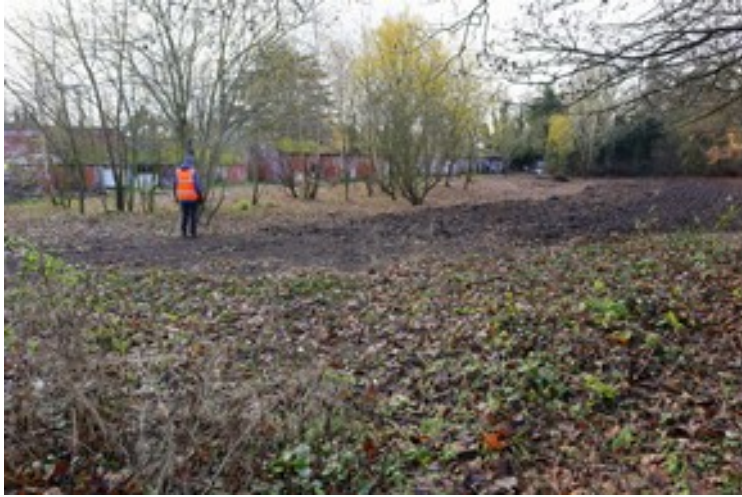
North slips now clear