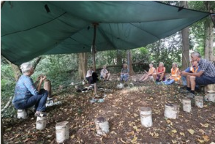
Volunteers helping with 'woodland adventure' area