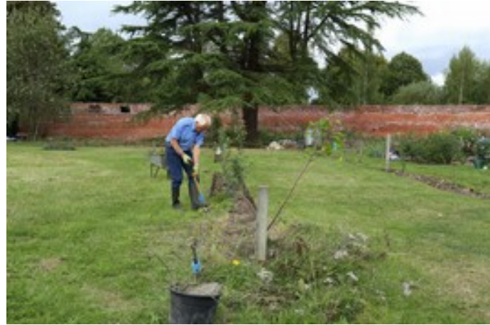
Weeding apple tree 'avenue'