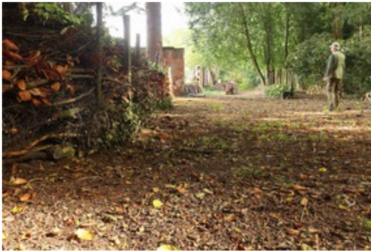
Dead-hedge and cleared south wall