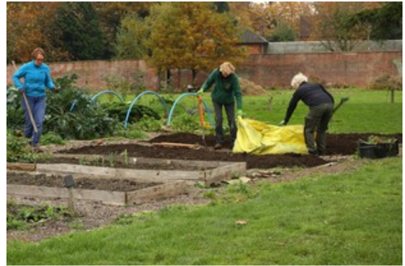
Preparing veg beds for next year.