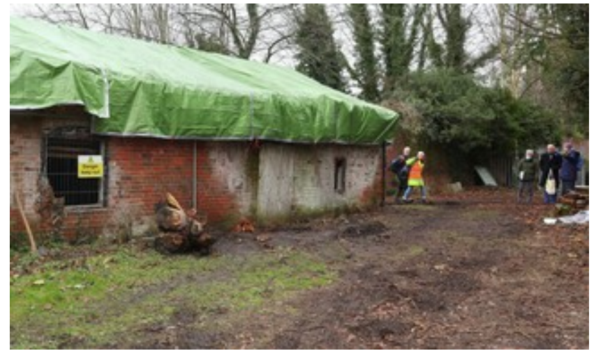
Basic protection for the old bothies