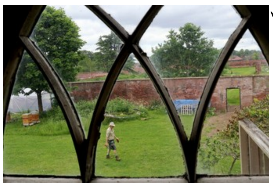
View from HGC