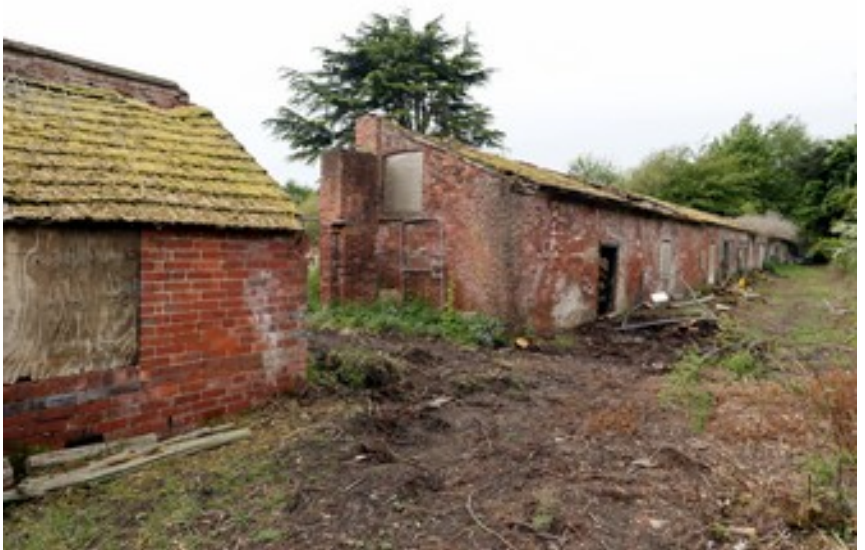
Clearing the back-sheds area (they're in a bad way!)