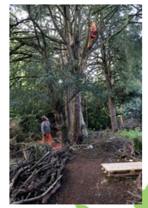
Trimming trees near cottage