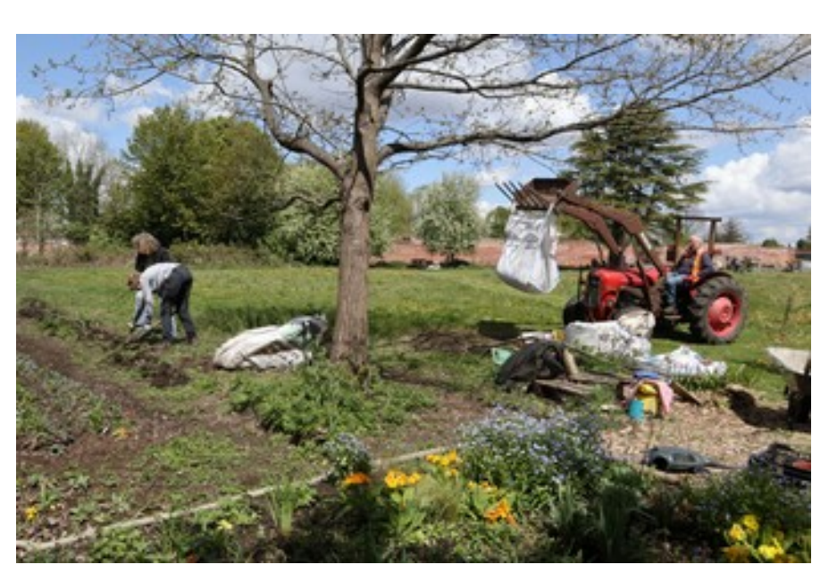
Preparation of west wall border