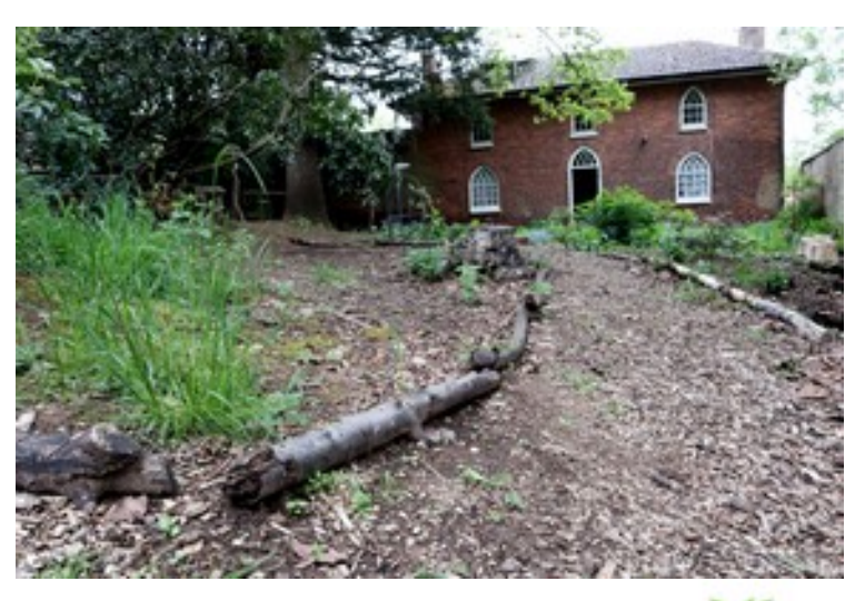
Head gardener's garden: clearing and re-planting