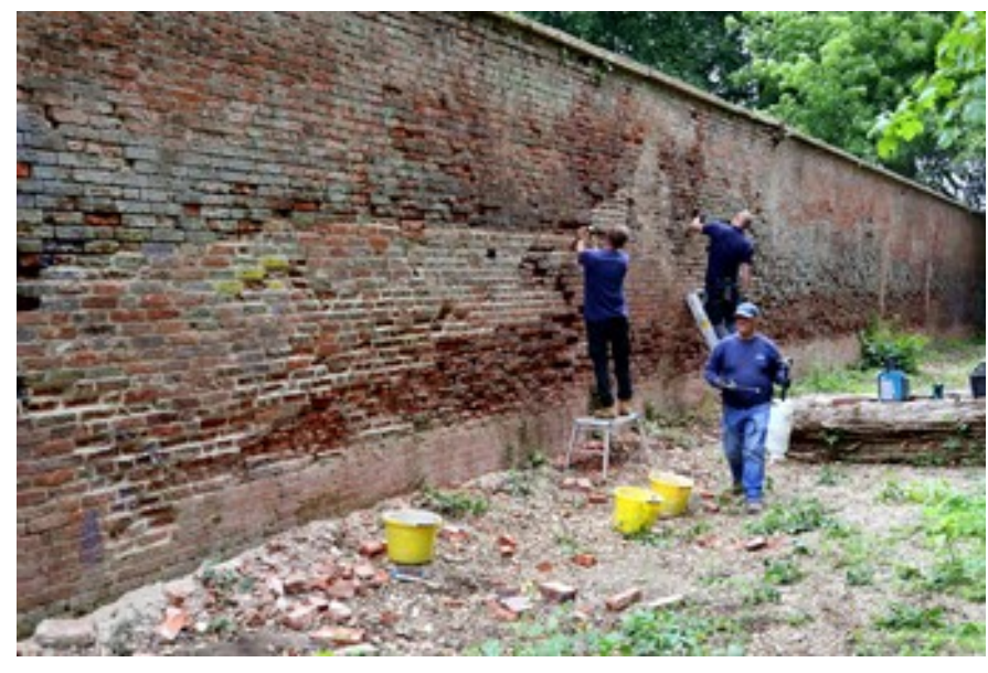
Bonsers repairing south wall