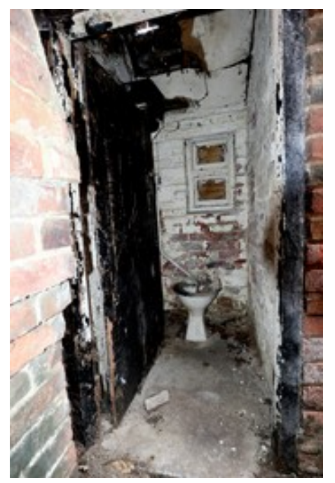
Is this a grade 2 listed toilet?