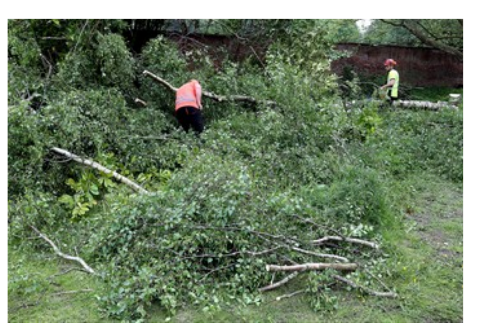
Tree clearance next to west wall