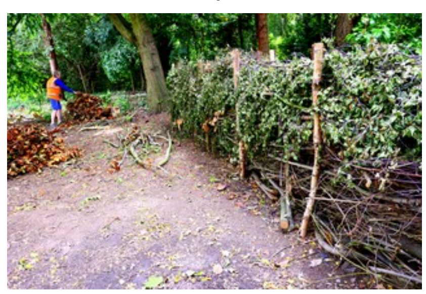
Dead hedge being extended by HV1