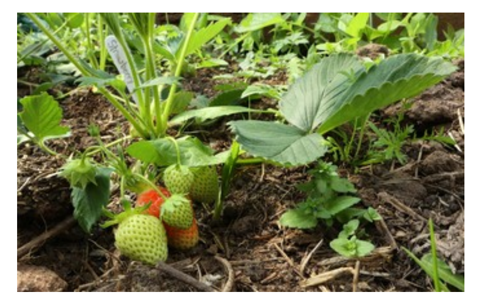
First strawberries in polytunnel