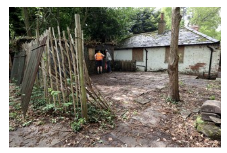
Lodge 1 back garden clearing