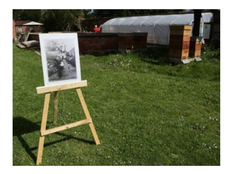
First garden tours underway