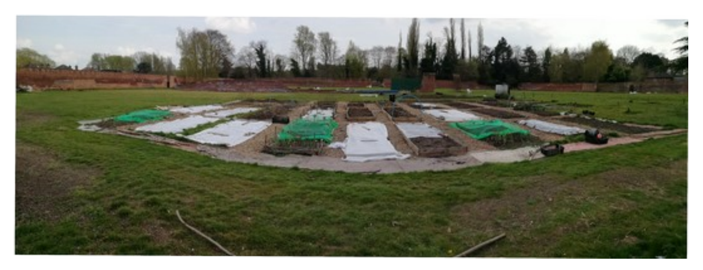
Veg plots underway