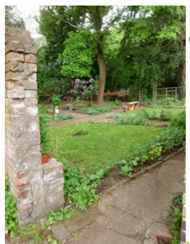
Head gardeners garden looking nice