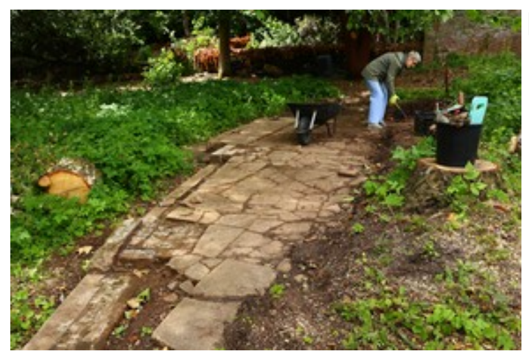
Ruth uncovers more of old conservatory