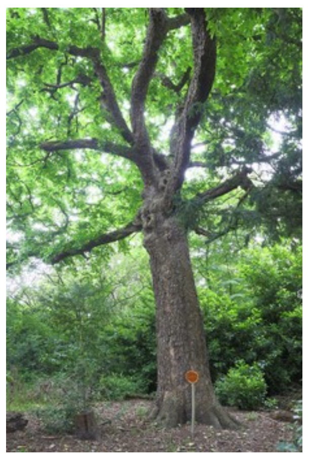
This Turkish hazel is a BIG tree!