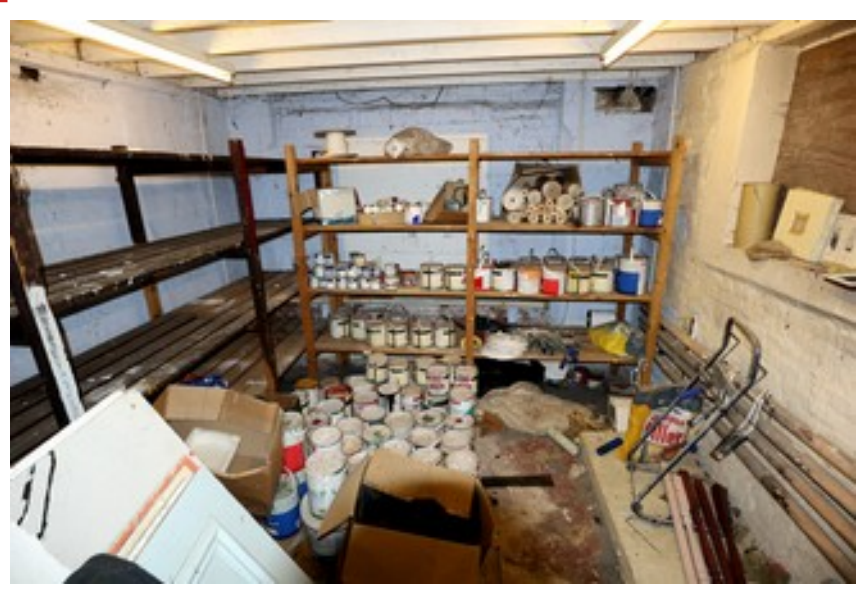
The new office?