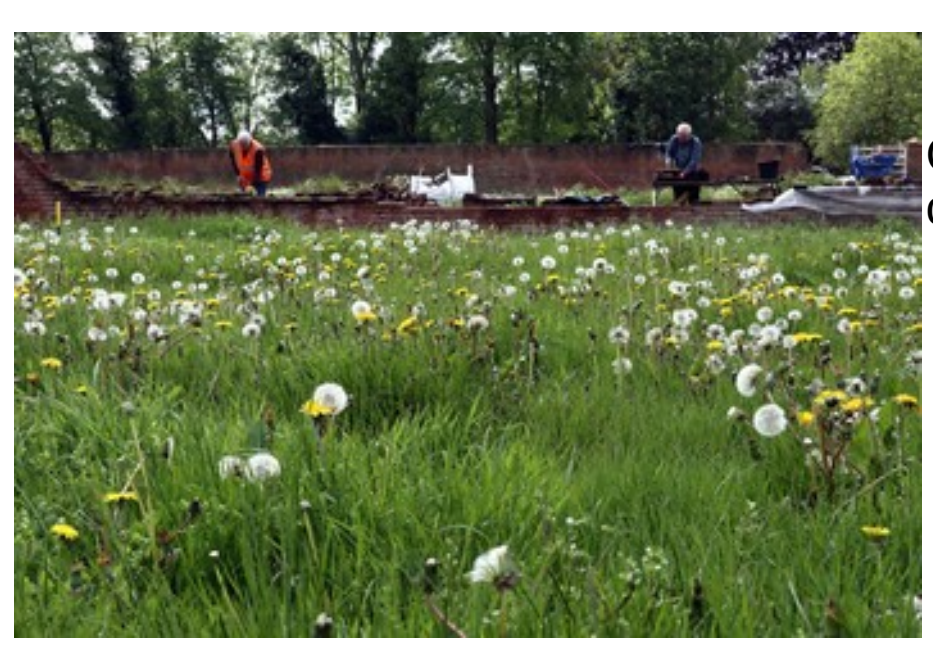
Central wall conservation