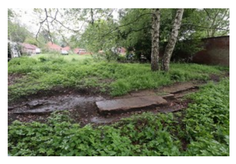
Ruth has found the old conservatory