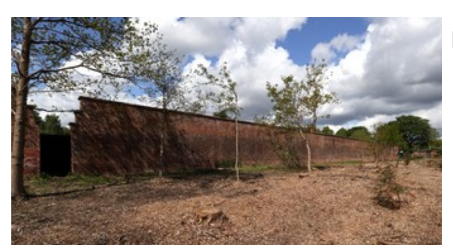
East slips cleared of trees