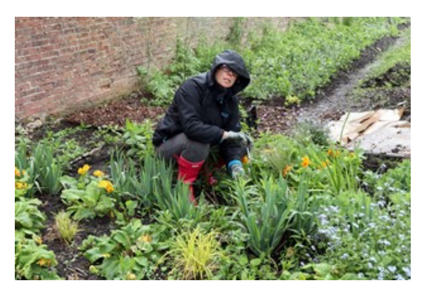
It's what volunteers do!