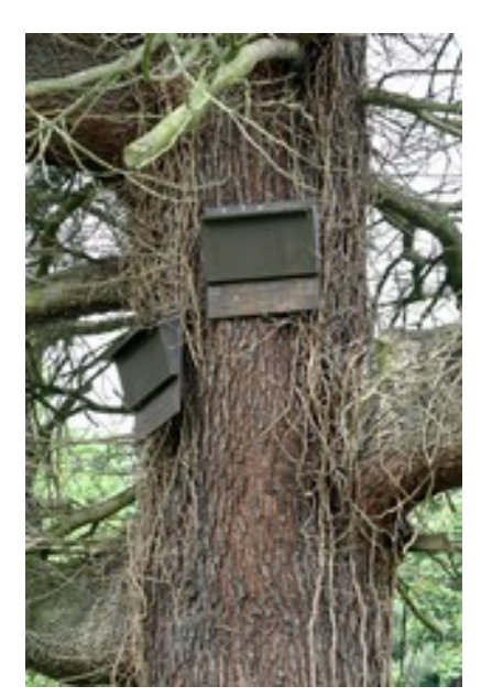
Bat boxes installed