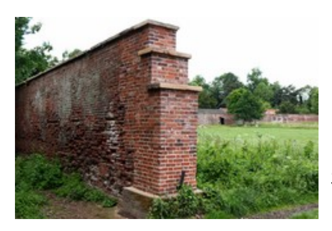
South wall gate repaired