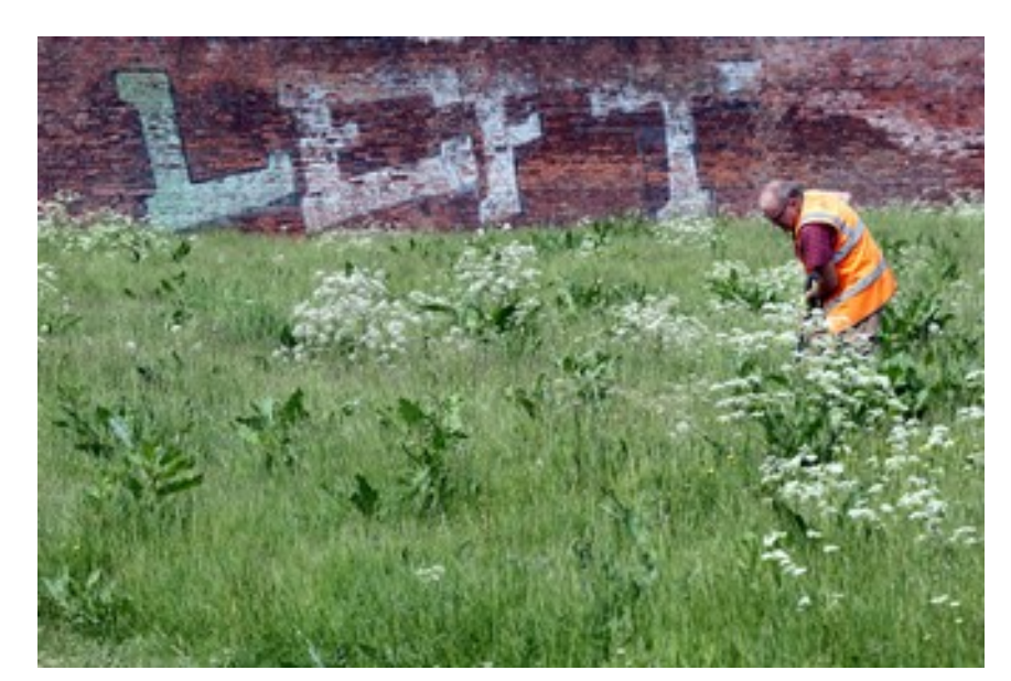
Too many weeds, too little time