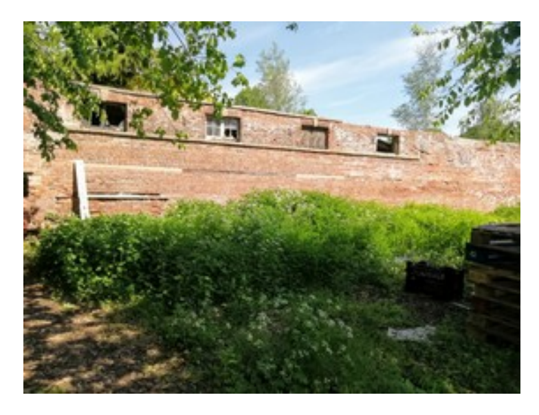
North wall 'accommodation'