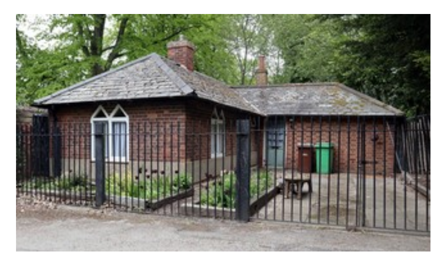
Lodge 1 tidied up