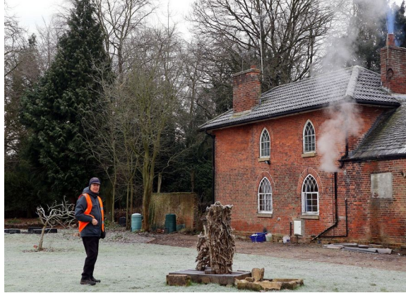
A frosty morning