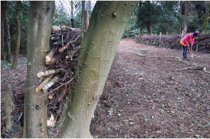
Finishing dead hedges