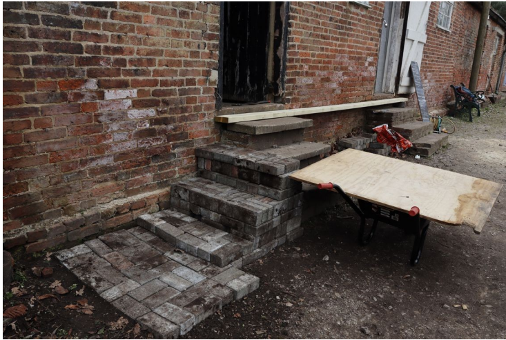
Beginning work on the access ramp