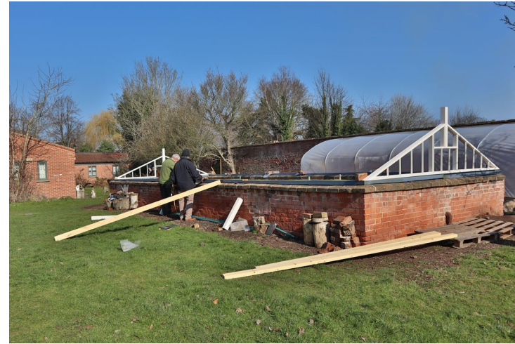
Cucumber frame progressing