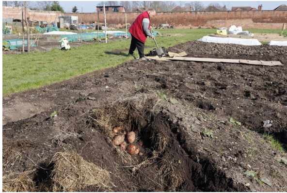
Last year's spuds from the clamp – they were OK.