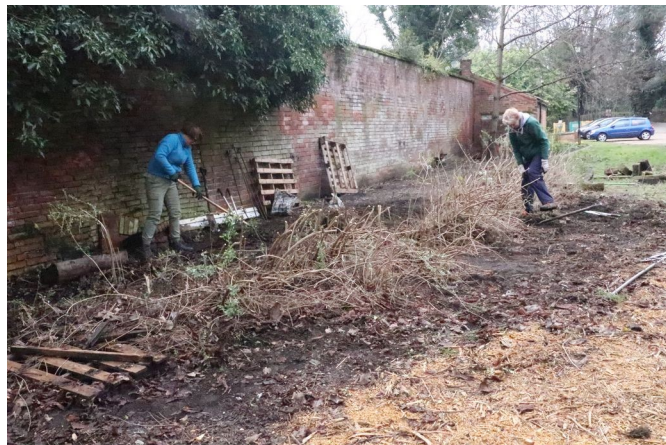
More work on the wildlife pond