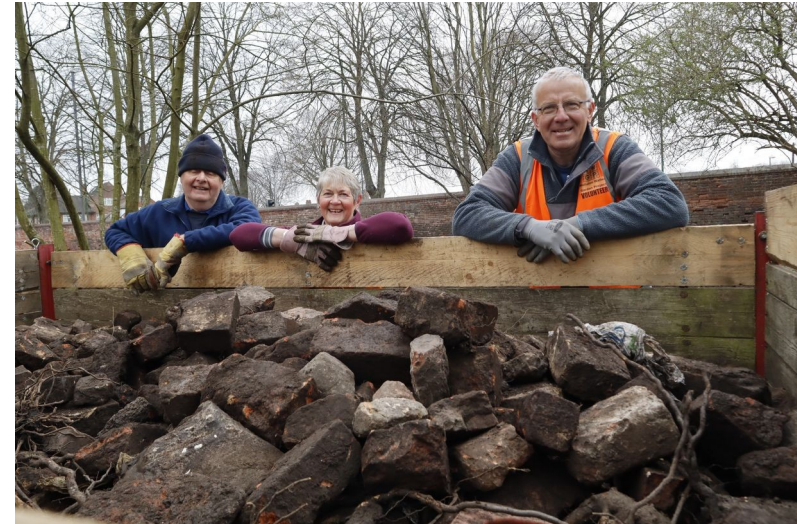
What a load of rubbish! (in the trailer)