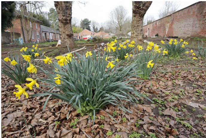
Spring in the old garden area