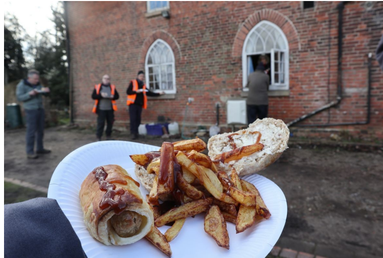
Chips and sausage roll Mmmm....