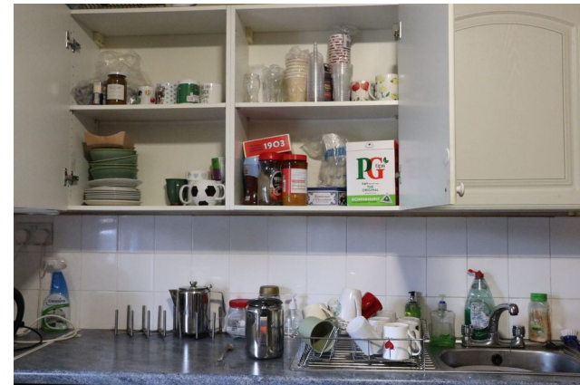
Where's the biccies! ... Oh I see 'em