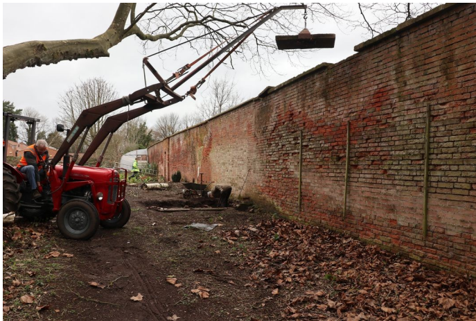
Anthony's new device for lifting the (very) heavy cap stones.