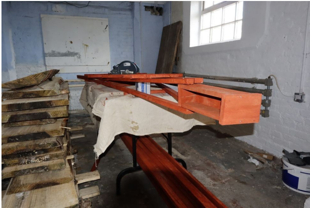
This will eventually be the new office