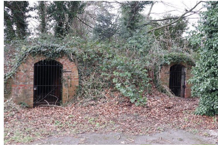
We have two icehouses – who knew?