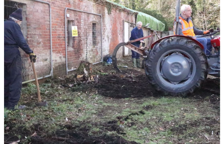
Stubborn tree roots!