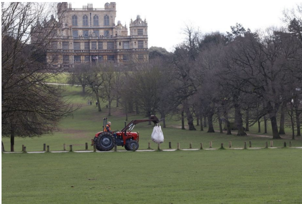
Anthony, on transport duty for the Park