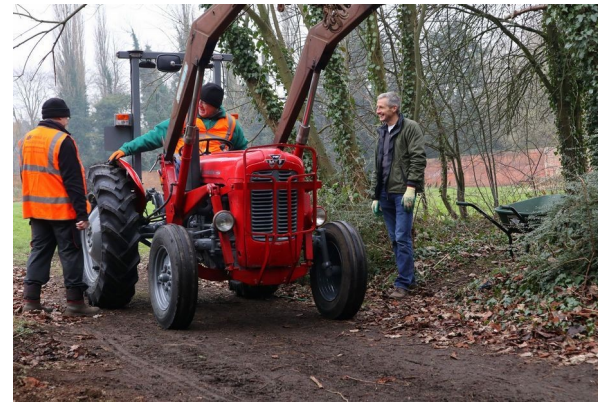
Tractor gets a make-over