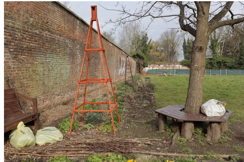
Geoff's new obelisks completed