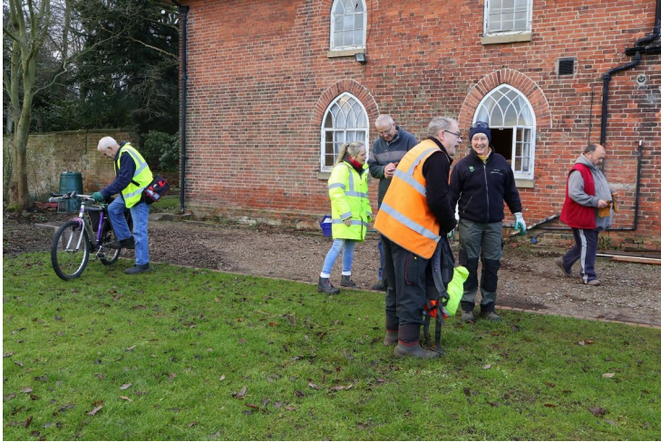
Early start, hopefully sober!