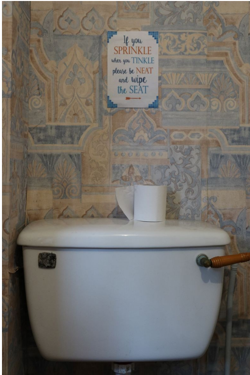
You know it makes sense.