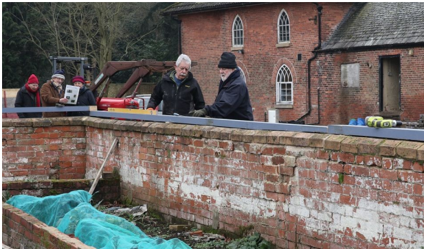
Cucumber frame discussions: Make sure it's level!