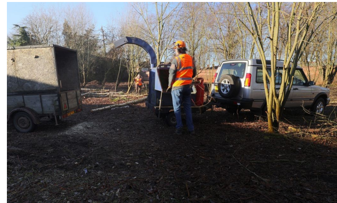
Chipper in action, clearing the north slip garden