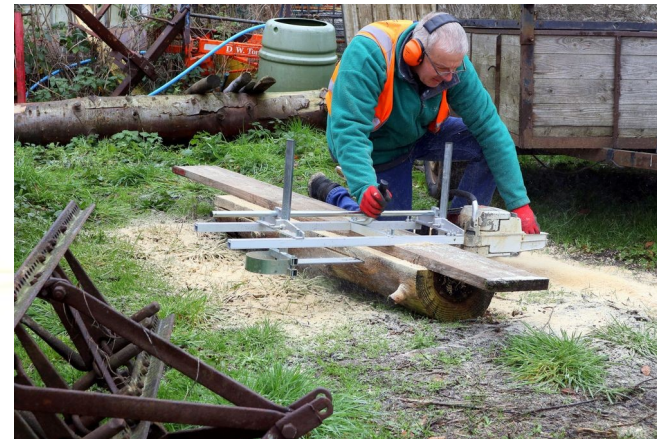
It's going to be a table!