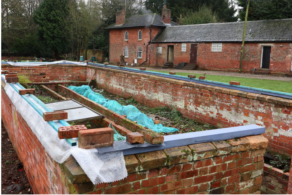
Cucumber frame base now fixed