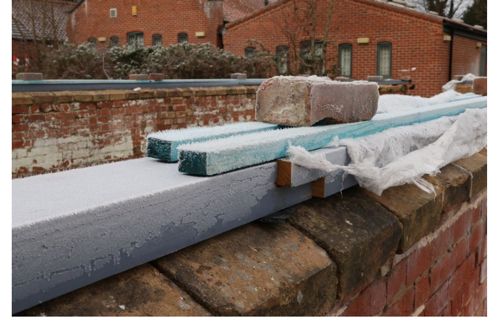
Starting the cucumber frame roof