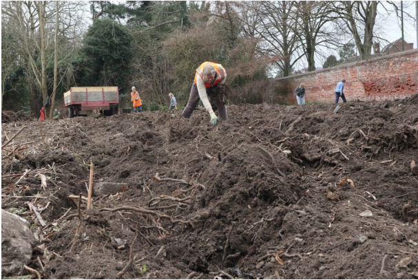
Clearing roots and rubble from the north slip