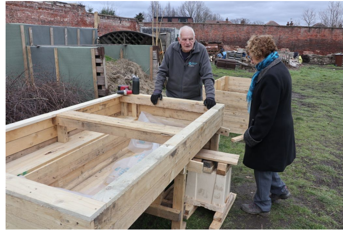
New accessible raised beds, ready for paint.