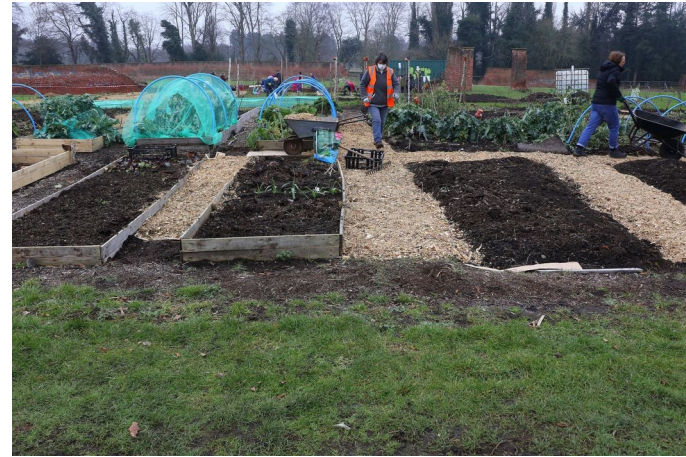
Preparing veg. beds and harvesting